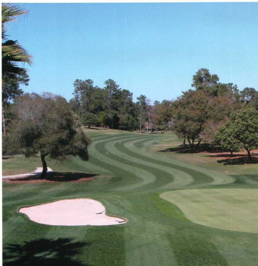
January 2003 Overseeding stripes at Deltona Hills G&CC.

What you do to your greens all year long affects your overseeding program. We are always verticutting and topdressing our greens throughout the spring and summer. That