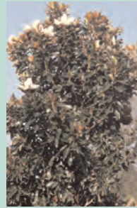
Little Gem Magnolia

Characteristics: This moderate grower has compact, upright branches in a narrow form. The dark green leaves with rusty-bronze coloring on the undersides are smaller that those of a standard Magnolia. Smaller fragrant white blossoms