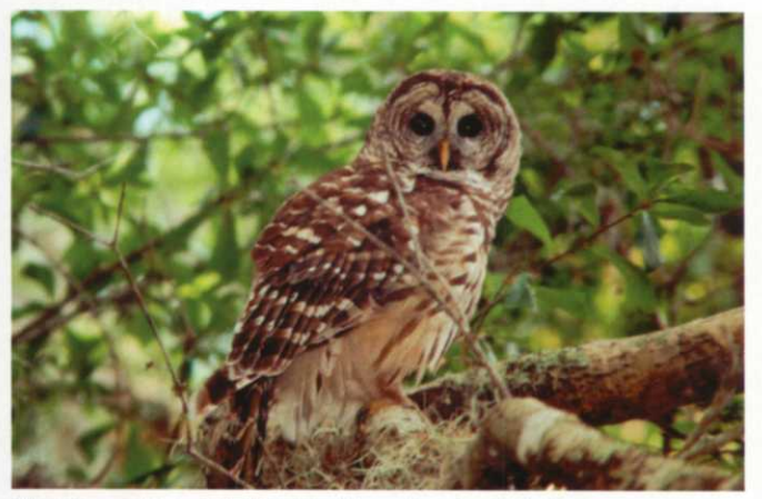
First Place - "Barred Owl" by Tom Biggy, Bent Tree C.C., Sarasota