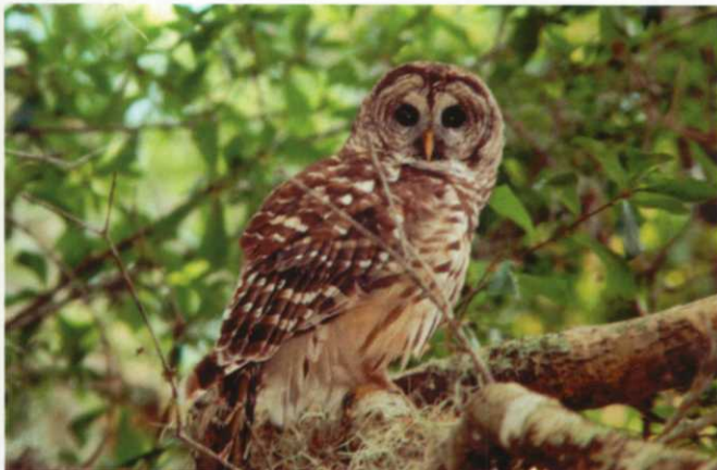
First Place - "Barred Owl" by Tom Biggy, Bent Tree C.C., Sarasota