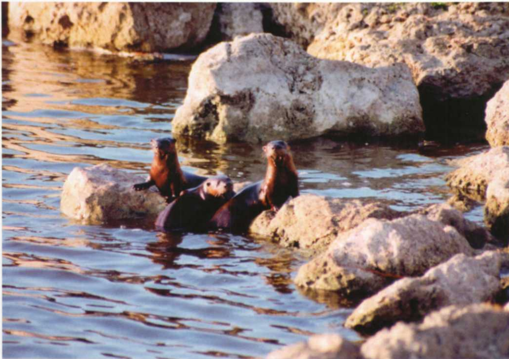
Best Overall Category 1 - Wildlife. "Otter Rocks" by Walt Owsiany, CGCS, Vineyards C.C., Naples