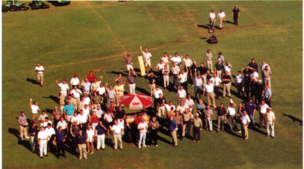
Aerial view of the Suncoast Supplier Appreciation Day attendees from 60 feet up courtesy of Save-On Enterprises' bucket truck. Equipment and product displays ringed the driving range.