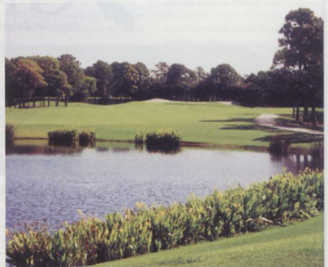
Second Place - Audubon C.C.