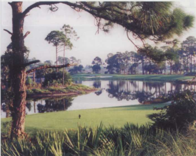
First Place - Reflections on a Par 3 by Neil Cleverly, The Old Colliers G.C.