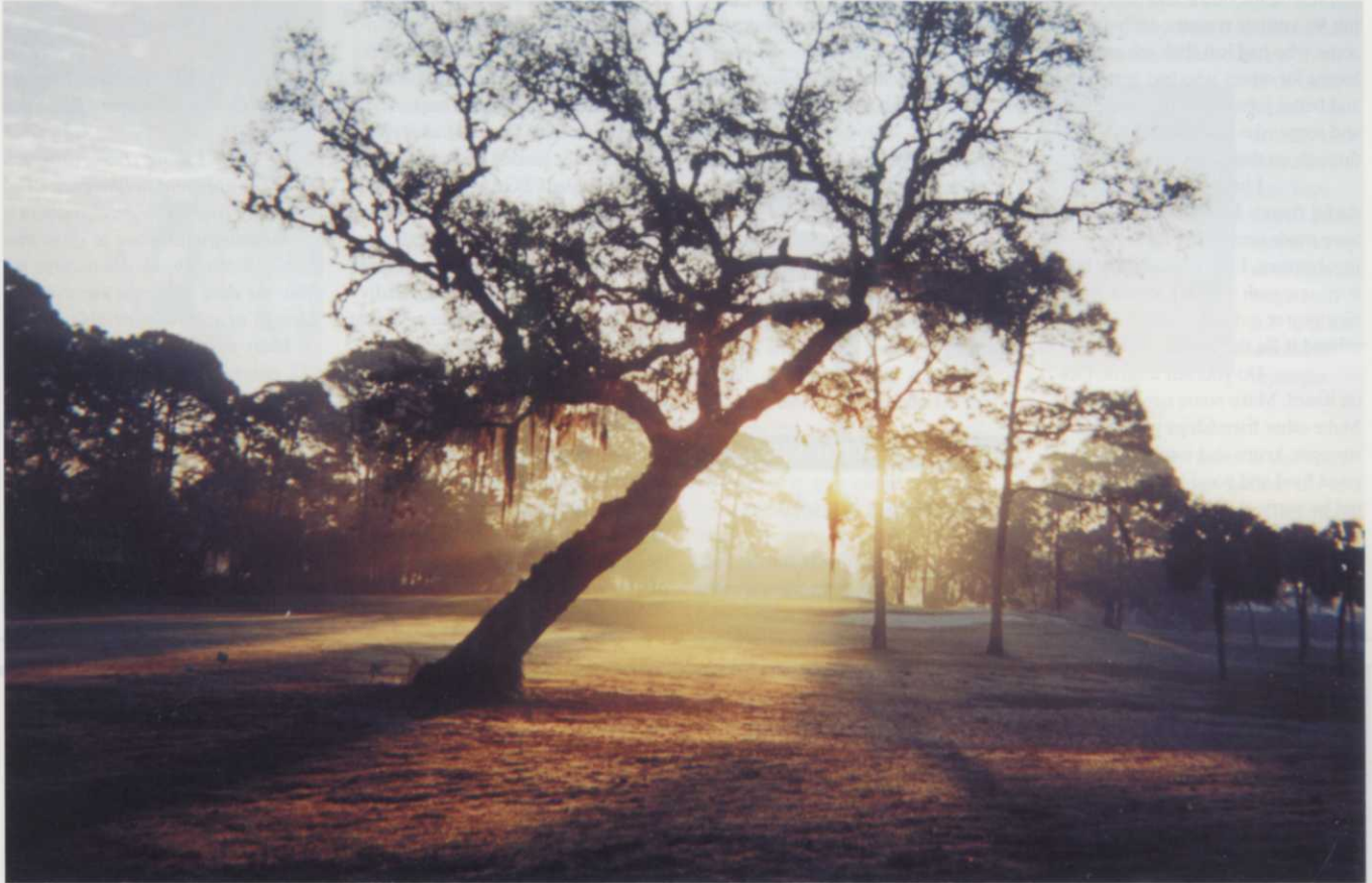
Editor's Choice - Sunrise on #10 Green by Tom Biggy, Bent Tree C.C.

Category 4 Scenic Hole - includes sunrises, sunsets, frosts, storms or any other interesting view of a golf hole.