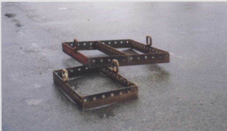
Bigger than standard pluggers. Less damaging than a sod cutter: Welded bedknives with lifting rings surgically remove Paspalum off-type patches in TifEagle greens.

his staff exude. The problem that they were facing was how to effectively and quickly remove paspalum off-type patches in his TifEagle greens and fill the void with pure TifEagle from his nursery green. A sod cutter would be too aggressive and lacked the preciseness that Hood preferred on the putting surfaces. The standard cup cutter or hexagon-shaped plugging tool would be too small for most of the patches and therefore would be too time-consuming.