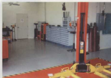
Read up on OSHA regulations and make sure your shop is always clean, organized and safe. You never know when an inspector might show up.

they reflect a good image of the people that trained them.