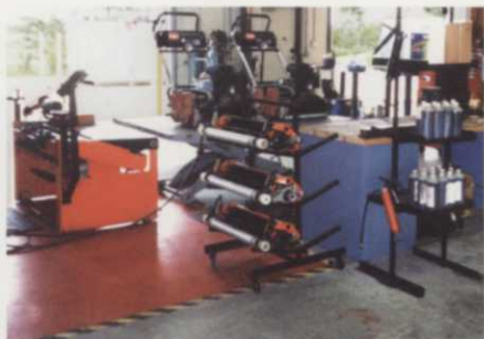
An equipment manager also has to be organized mentally and in the physical work space to get the job done properly.