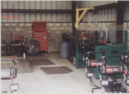
The shop work areas are kept neat and clean. Access is limited to the mechanics.

annually and biodegradable fluid is used.