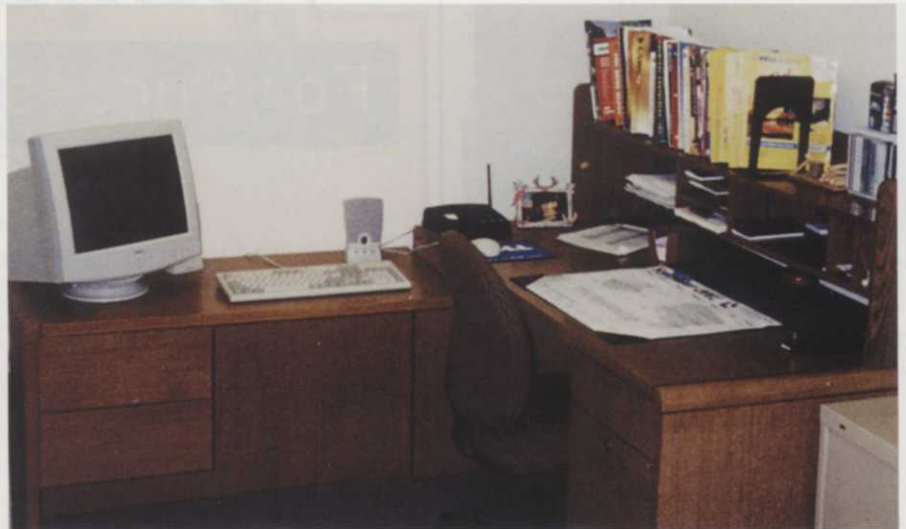
The Red Stick equipment manager's office. Having strong communications and computer and skills can help the shop operate in a more efficient manner.

After you get the positive attitude perfected, it's time to work on patience. I don't know about your club, but it seems everywhere I've been, there is always one maniac operator who consistently breaks