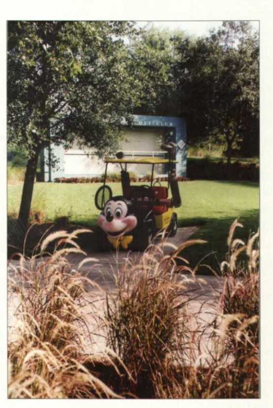
Category 1: Wildlife on the Course. the largest mouse in Central Florida.

tape on the back of the photo. Slides must be easily removable for viewing.