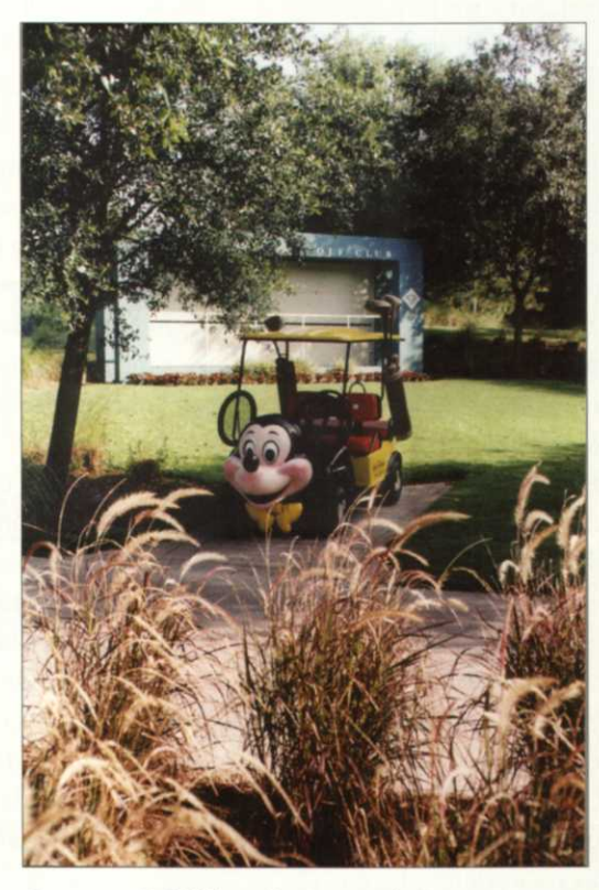
Category 1: Wildlife on the Course, the largest mouse in Central Florida.