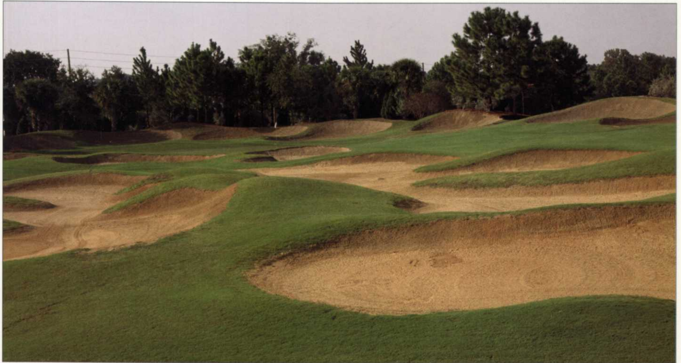
Number 14 "Bunkers by the Dozen." It's only 167 yards from the back tee, so all the sand should just be a mirage.