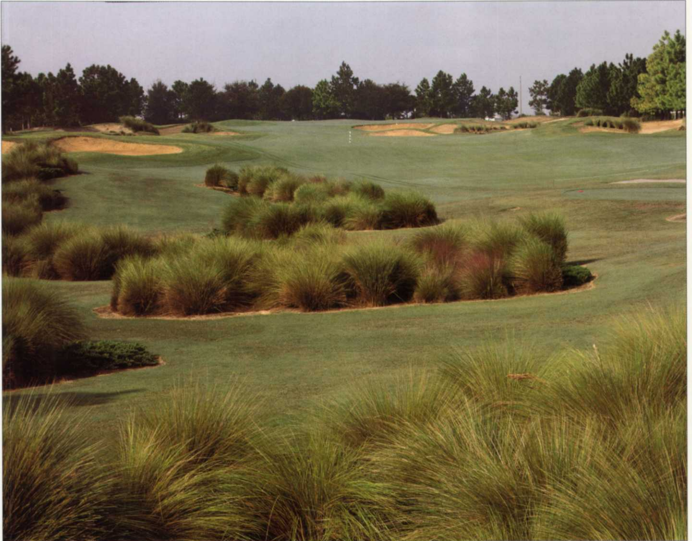
Number 2 "Texas Dolly." She may not be long at 374 yards, but she's no lady if you try to let the "big dawg eat" off the tee.

emergency and you forget half of the things you've seen. I have found it quite