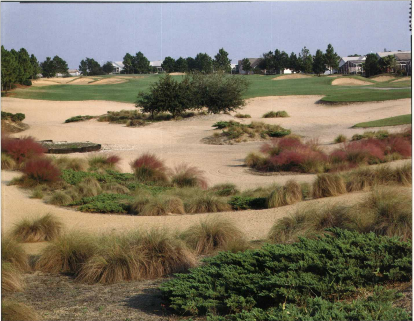
“Heaven’s Gate” is 413 yards uphill. The bunker in the foreground is near the tee complex and serves as one of the runoff retention areas for the development.

“Maybe PDI will provide the tools to communicate (our) value, but it still boils down to the individual person growing good, healthy turf and earning respect for who he is and what he does at his own club.”