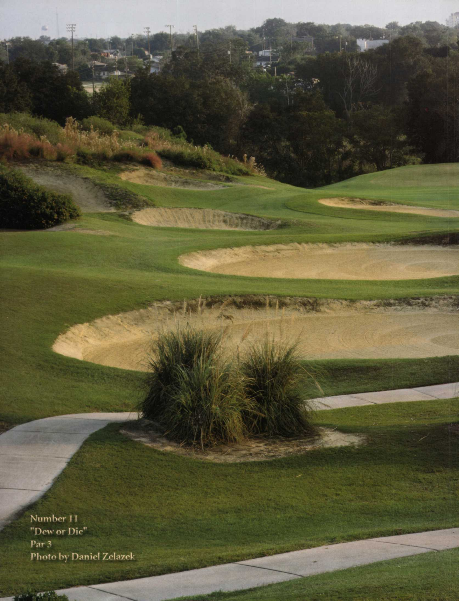
Number 11 "Dew or Die" Par 3