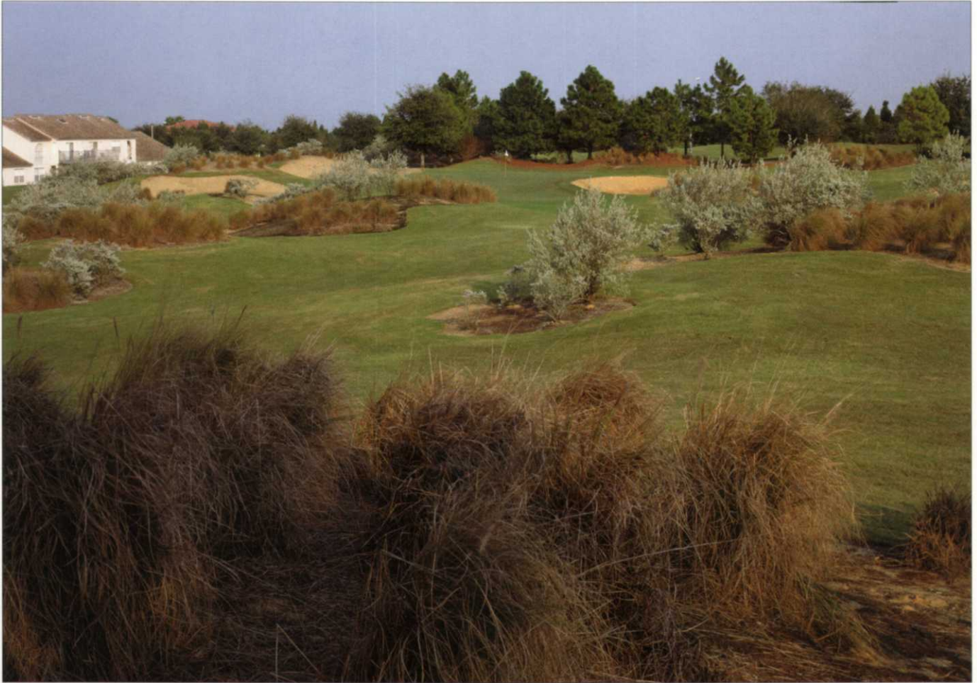
Number 9 "Press 'Em Up." The key to success on this 542-yard hole is to stay out of the Texas sage, the cordgrass and the dunes, so you can putt the two-tiered green in regulation.

of opportunity and many never inherit an as-built blueprint either."