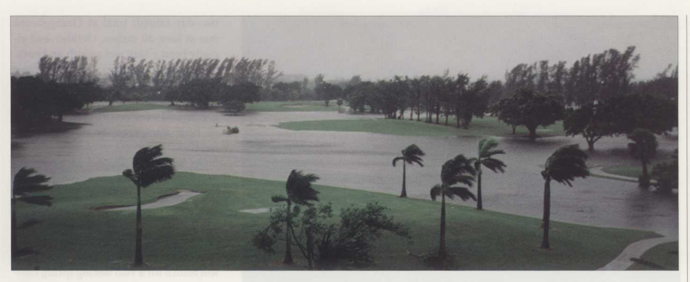
After: The same two holes immediately after the hurricane.