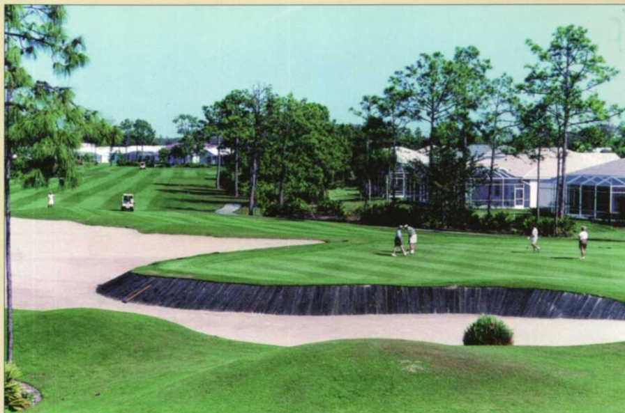
Scenic Hole Layout Includes sunrises, sunsets, frosts, storms and any other golf hole view.