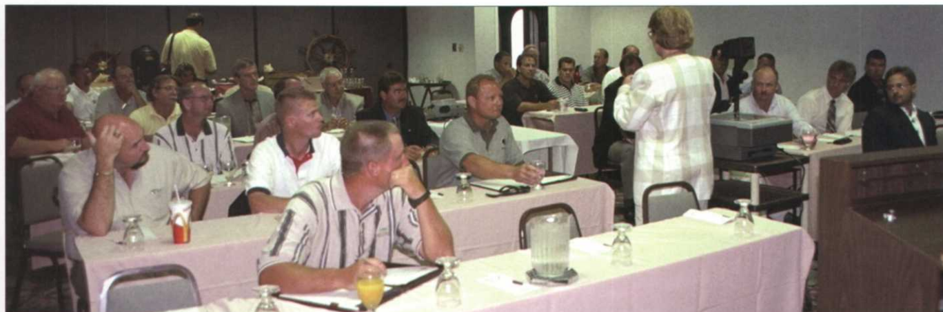
Forty-one Florida superintendents from around the state met in Orlando to learn about wetlands and golf courses. See story on page 52.