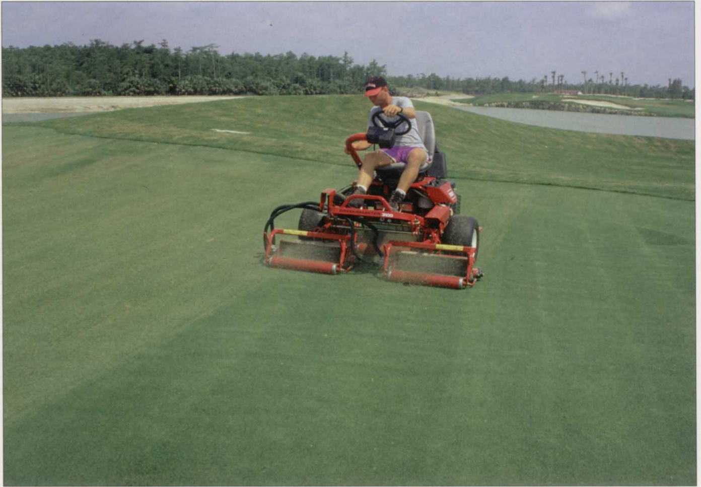
One of the key elements in managing the aggressive Champion ultradwarf putting surface is a regular verticutting program.

As thin as these are, you cannot grind them successfully.