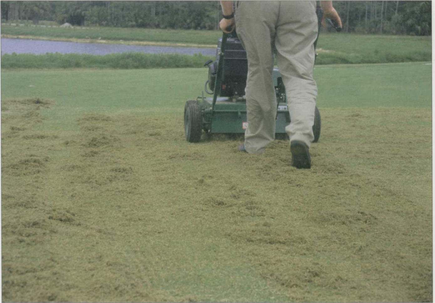
Once a year, usually in May, an aggressive Mat-A-Way verticutting is performed to control potential thatching.