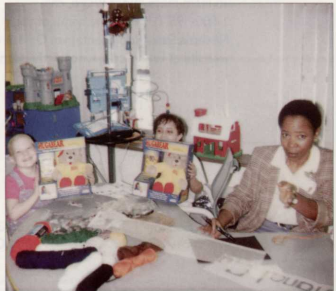
Patients and staff in the Pediatric Oncology Group of the Richard and Pat Johnson Children's Hospital were all smiles after receiving holiday gifts from the Palm Beach Chapter.

I want to thank you for your commitment to the Richard and Pat Johnson Children's Hospital at St. Mary's Medical Center. Many, many thanks for your continued support."