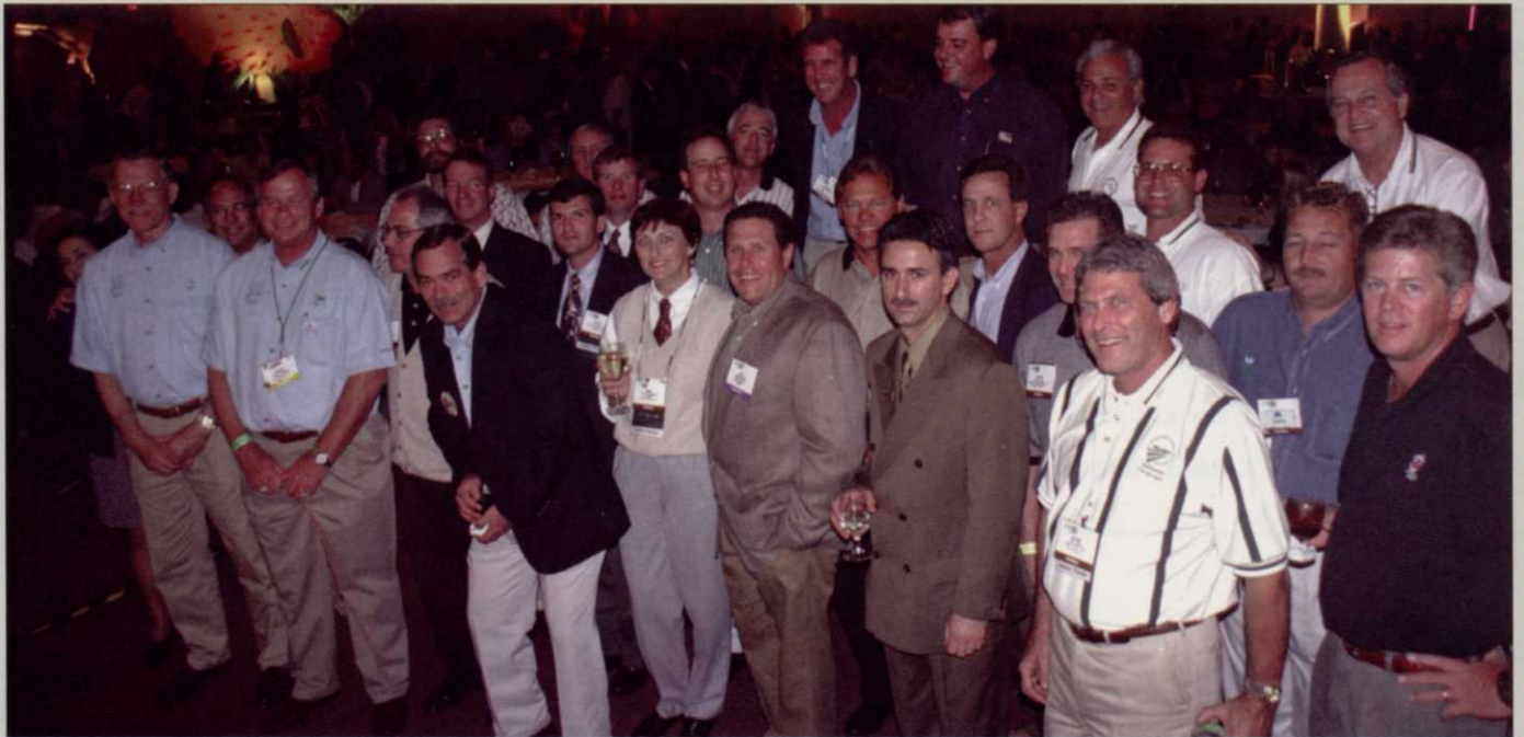
Many thanks to our Presenting Sponsor, The Kilpatrick Company and all the Platinum, Gold and Silver Sponsors shown here for making the 1999 FGCSA Reception possible.