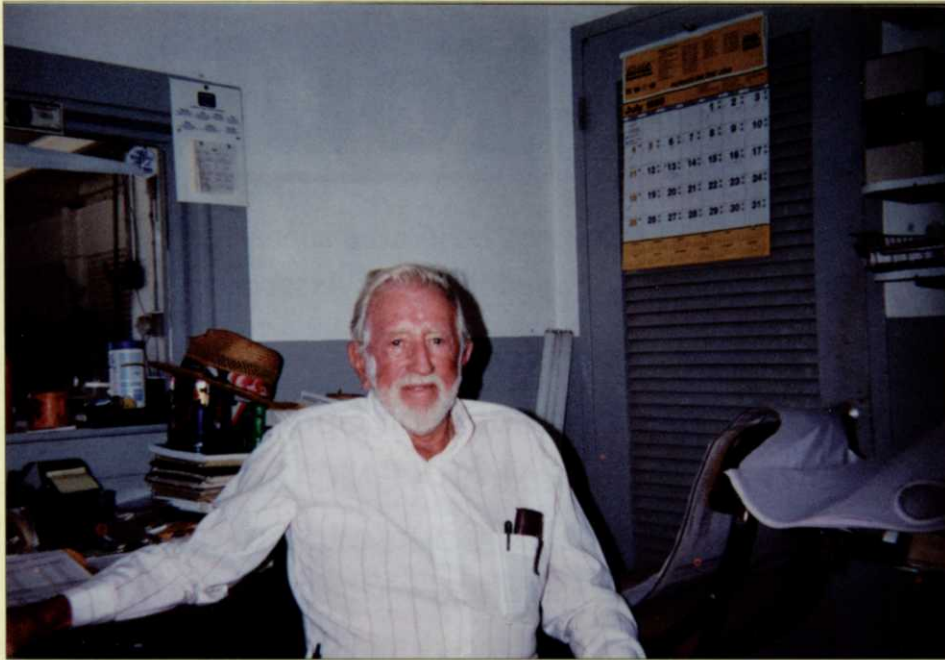
SOUTH FLORIDA GCSA