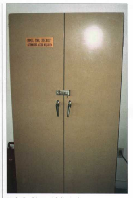
Locked cabinet with limited access......