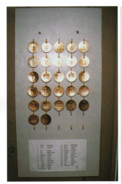
which are checked out using a numbered employee ID tag.