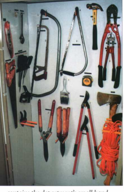
.....contains the department's small hand tools......