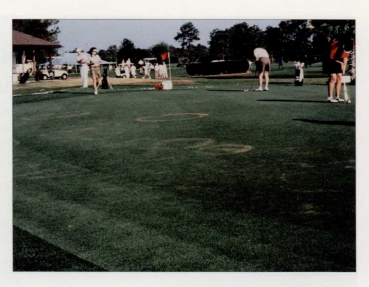
Golfers putt on practice green with fairy ring at Sun 'N Lake Golf Club in Sebring.

erything he could think of to control the problem: wetting agents, extra water and fungicides. He finally used the curative rate of ProStar® 50WP Fungicide and the problem cleared up within two weeks.