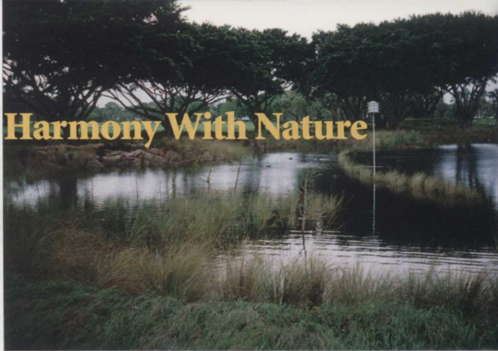
The same wetland area after construction. The improved wetland is now home to 5,000 cordgrass plants, purple martins, mallard ducks, coots, gallinules and American widgeons.

The Country Club of Florida first joined the Audubon Cooperative Sanctuary Program for Golf Courses in 1991. Its Audubon Committee was formed in 1996. It became certified in Environmental Planning in April 1997, and in December 1997 became certified in Out-