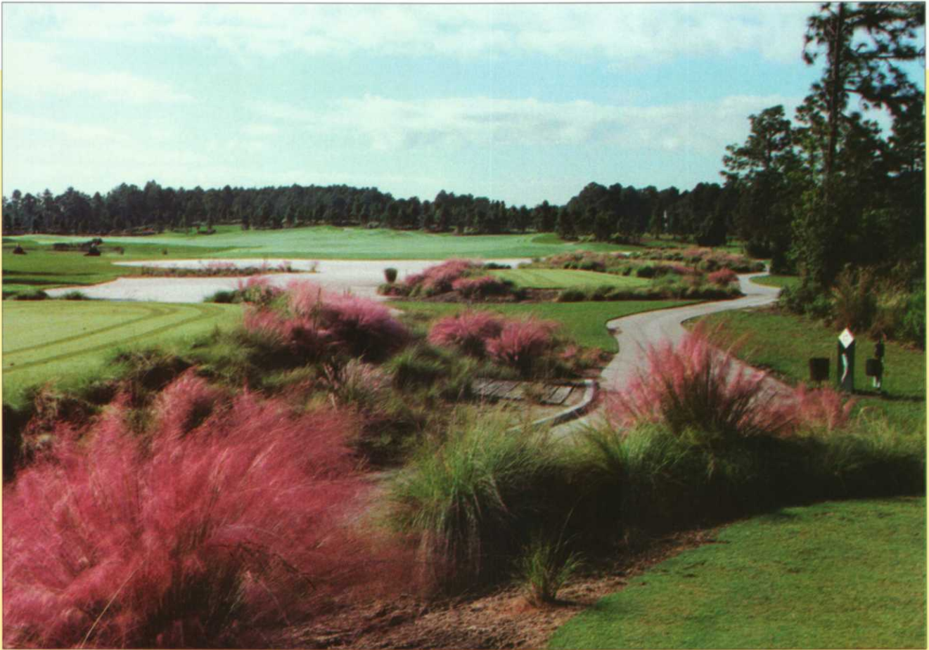
1997 Photo contest - Category 3 — Native plantings, Gulf Muhly. No. 17 tee at Disney's Eagle Pines GC.