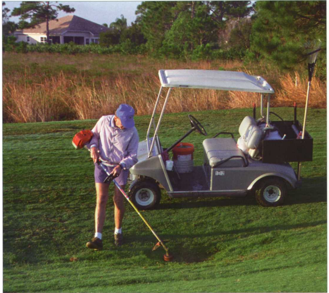
If a drain needs trimming, the detail employees have their equipment with them.