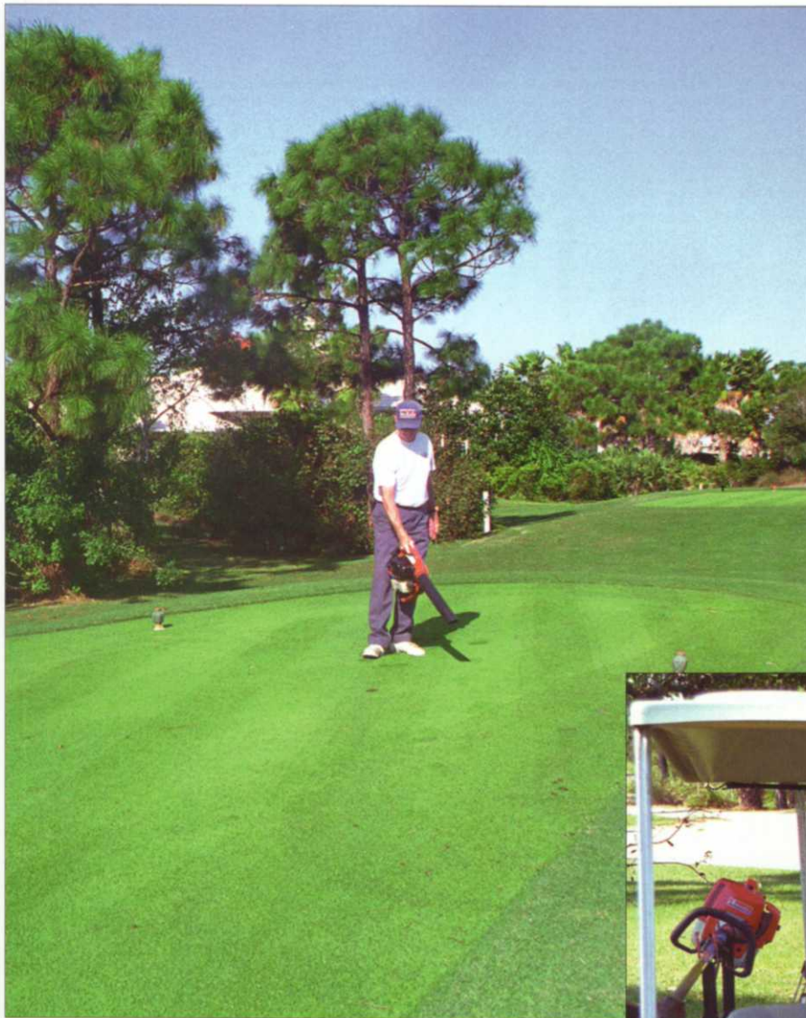
Pine needle accumulation on the tees causes havoc to mowers and is unsightly. Detail personnel takes care of this problem before play gets there.

Normally their pre-play routine starts by sweeping divots and tees from the range using a mechanical “Parker sweeper,” which is pulled behind one of the carts. Then fairway divots are filled and miscellaneous debris is picked up. It is also the time to trim fairway drains and irrigation heads as needed.