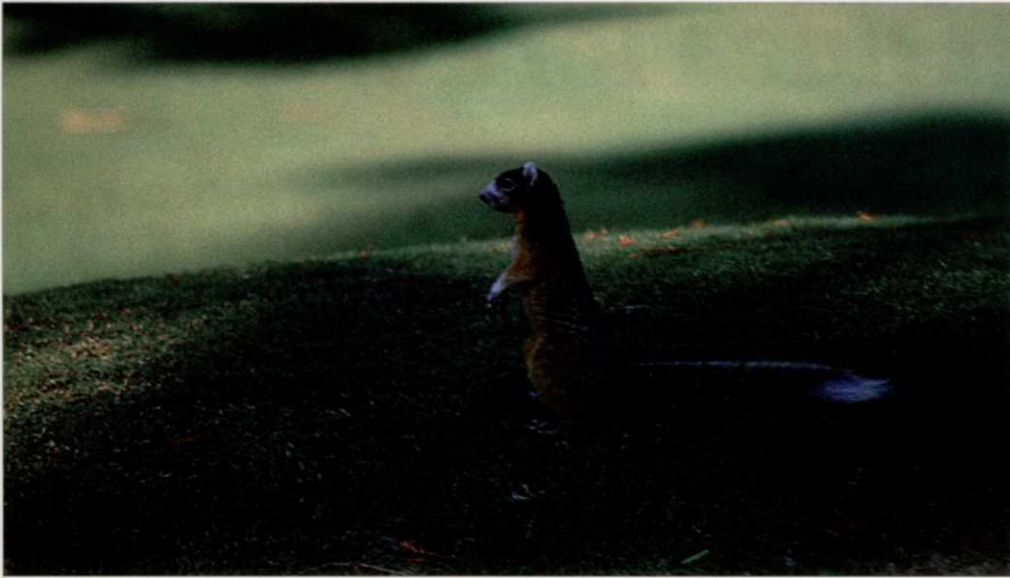
Fox squirrels are native to pine forests with open understories and spend a lot of time on the ground so golf courses with open pine and cypress stands are good habitat for them.

ment, the upland pines, is also their prime habitat," Ditgen said. "They disappear shortly after intense development because they just don't do well with cars and cats and dogs."