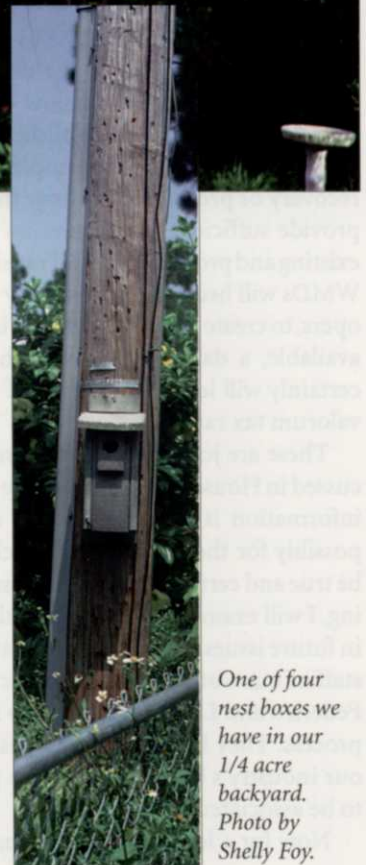
One of four nest boxes we have in our 1/4 acre backyard.

In the backyard program, there are four categories: Wildlife and Habitat Management, Water Enhancement and Conservation, Energy Conservation, and Waste Management.