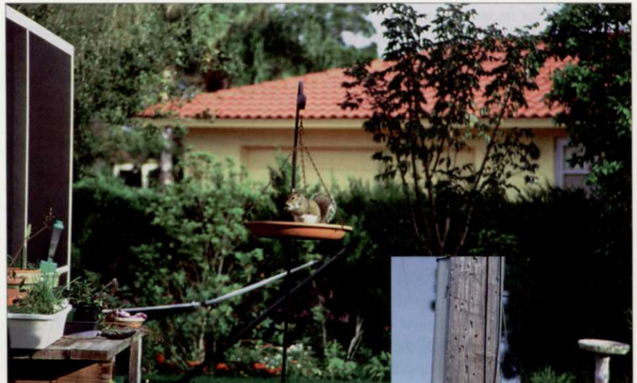
You can't live with them and you can't live without them—when you have bird feeders in your backyard.

In the backyard program, there are four categories: Wildlife and Habitat Management, Water Enhancement and Conservation, Energy Conservation, and Waste Management.