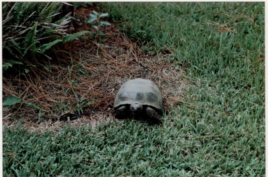
The neighborhood gopher tortoise visits our backyard.