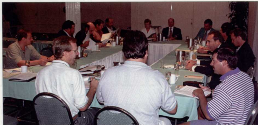
The FGCSA Board Meeting gets an early start Friday morning to address association business. Unfortunately, not all chapters were represented.

The members of the group will be available to assist on committees and answer any questions the current board may have. Since each past president has