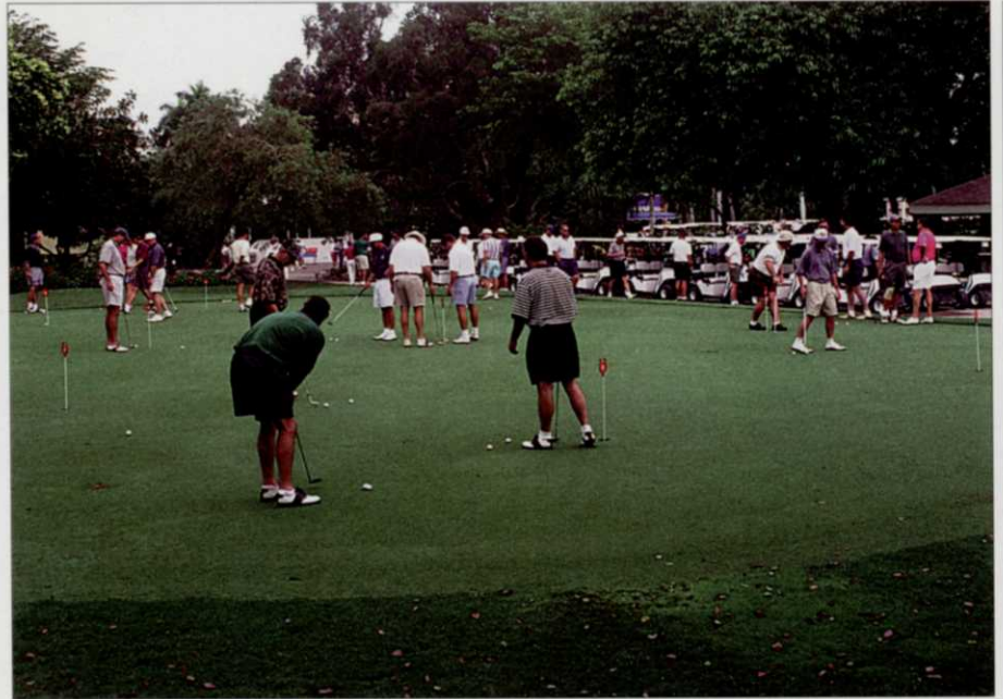
Contestants warm up Sunday morning for the G. C. Horn Memorial Tournament which raises money for turf student scholarships.

•TURF TRACER • FOAM GARD • RUST BUSTER • BEAUTY GREEN • PENETROL • KICK IN THE GRASS • TURF IRON • SUPER WET • EV R GREEN • KNOCK M' DED • GRIME OFF • GREEN LAPPING SOAP • RUST BAN • GREEN MAGIC SCRAM // TURF KOTE • WATER PENN • GREEN MASTER