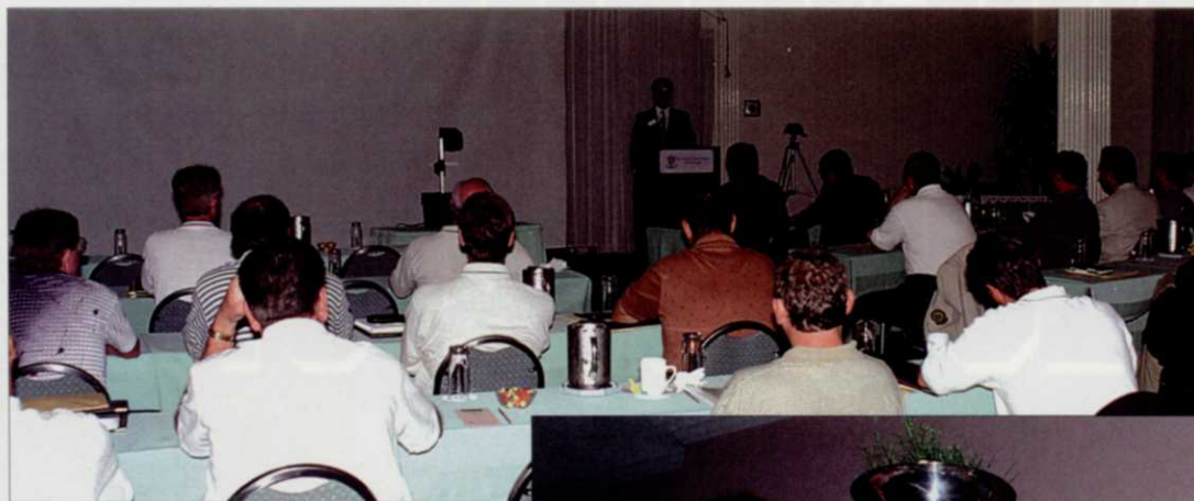
Superintendents seeking CEUs and information learn how to deal with the media and prepare for interviews at this year's Poa Seminar.

served at least four years on the board and in many cases remains active in local chapters and on FTGA and GCSAA committees, the council is seeking to organize all that service and leadership experience to provide a ready resource to the officers and directors of the association.