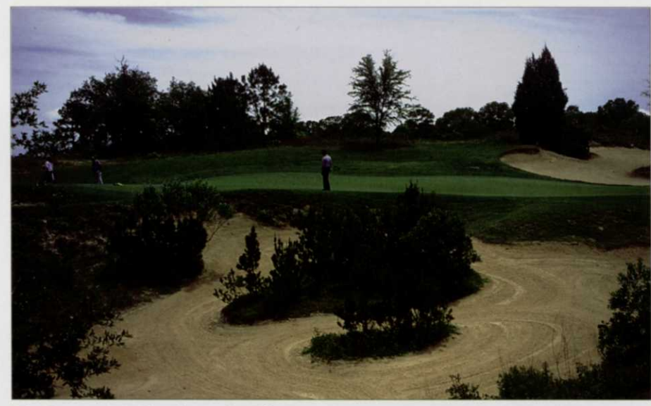
Pine Barrens G.C.