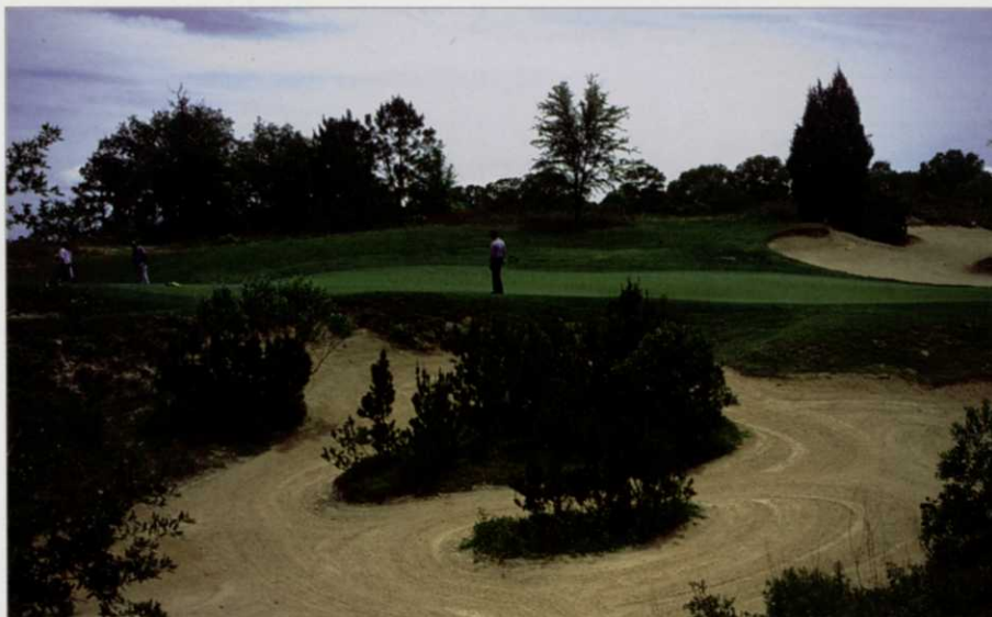
Pine Barrens G.C.