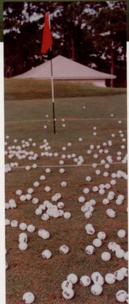
Third Annual Helicopter Hole-In-One sponsored by the Hobe Sound Women's Club. Helicopter donated by Greg Norman drops numbered golf balls purchased by participants. Closest to the pin wins!