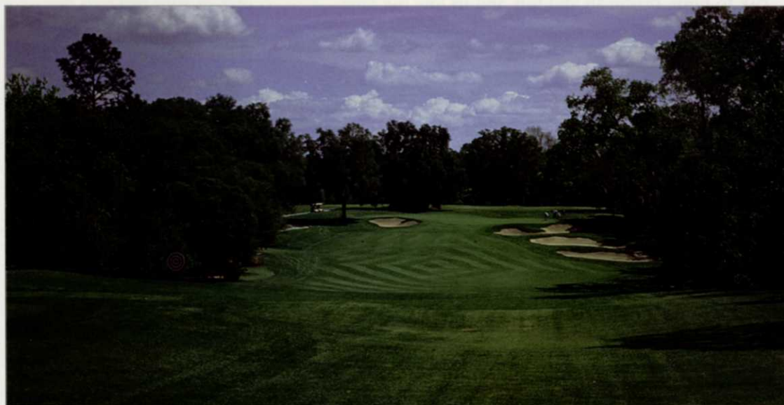
Rolling Oaks G.C.