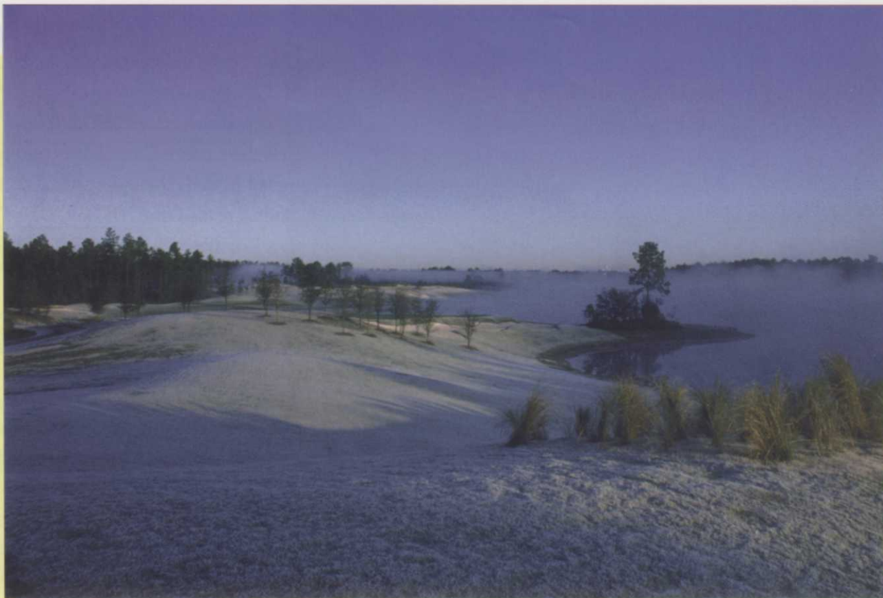
1997 Photo contest - Category 4 — Scenic Hole Layout, Frosty Morn on Disney's Osprey Ridge GC.