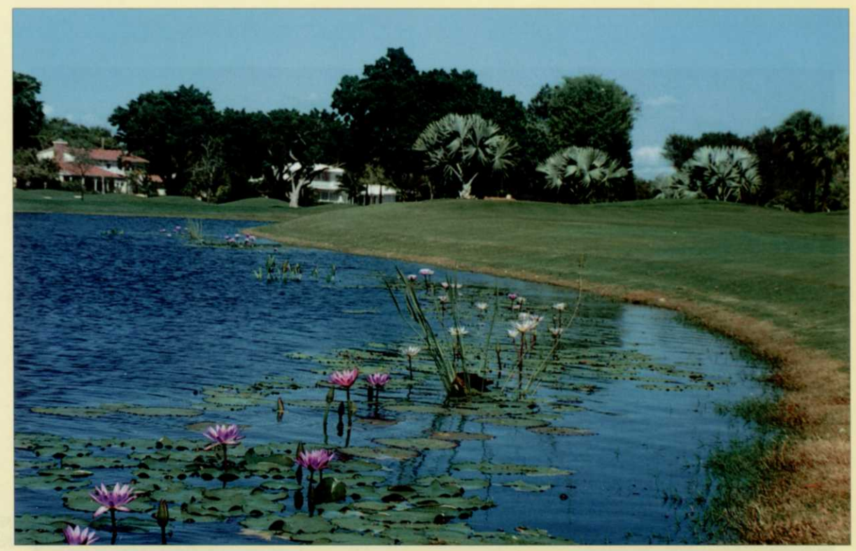
Second Place, Native Plantings Debra DeMarco Riviera CC