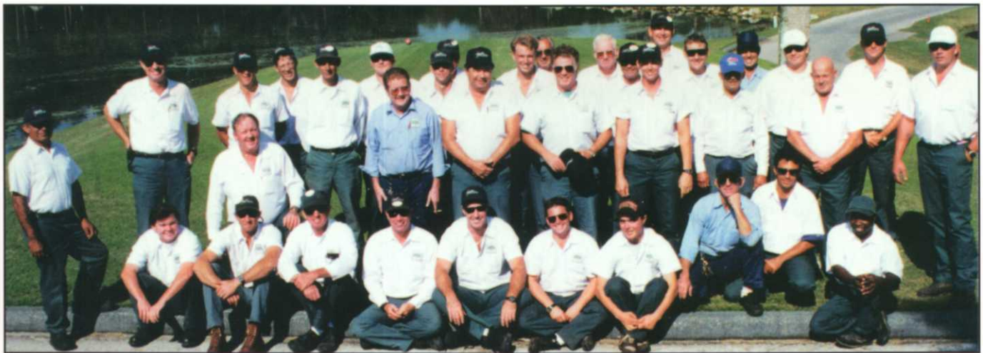
Magnolia, Oak Trail and Palm crew members meet on Palm #16 to take a bow for a great job well done during the Classic.