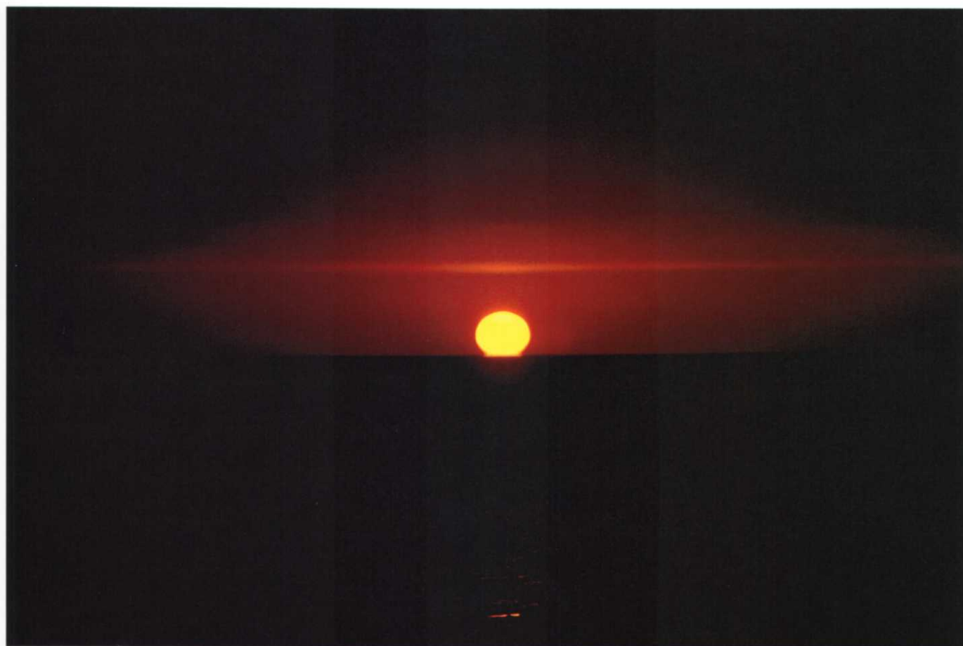
Out-of-towners soon became “sundowners” at the Naples Beach Club.