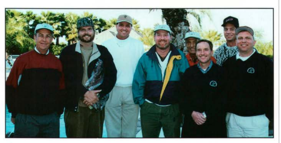
The LCCC Fund Raiser Tournament Committee weathers another successful event.

A message from your golf course superintendent and GCSAA