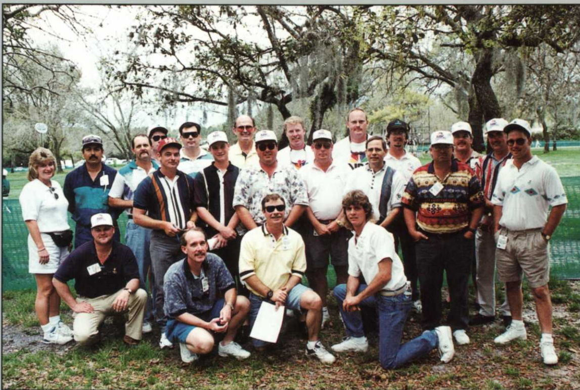
Central Florida Chapter volunteers gather before getting group assignments "inside the ropes" at the Nestle Invitational.