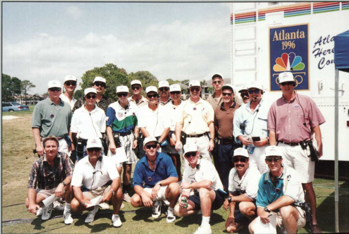
Palm Beach Chapter spotters all geared up for the Senior PGA event at PGA National.