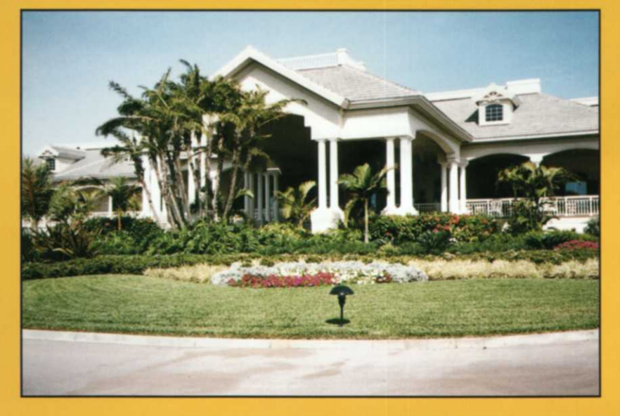
Catogory 2a 2nd Place (left) -The Sanctuary Golf Club by David Wood

Category 2b Course Landscaping Use of Native Plants