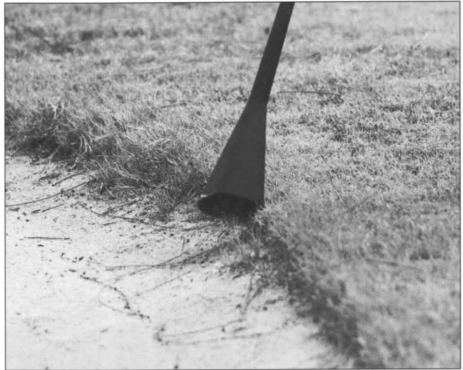
An inverted square-mouthed funnel attached to a spray wand gives a nice crisp edge when chemically treating bunkers.

Chemical edging does not eliminate mechanical edging, but it does reduce it tremendously. Back in the old days, if we were to keep our bunkers neatly edged all the time we had to mechanically edge them 15 to 20 times a year. Today, because of chemicals, I need only mechanically edge bunkers four times a year. In the last few years I have discovered the stick edger . A stick edger is simply an