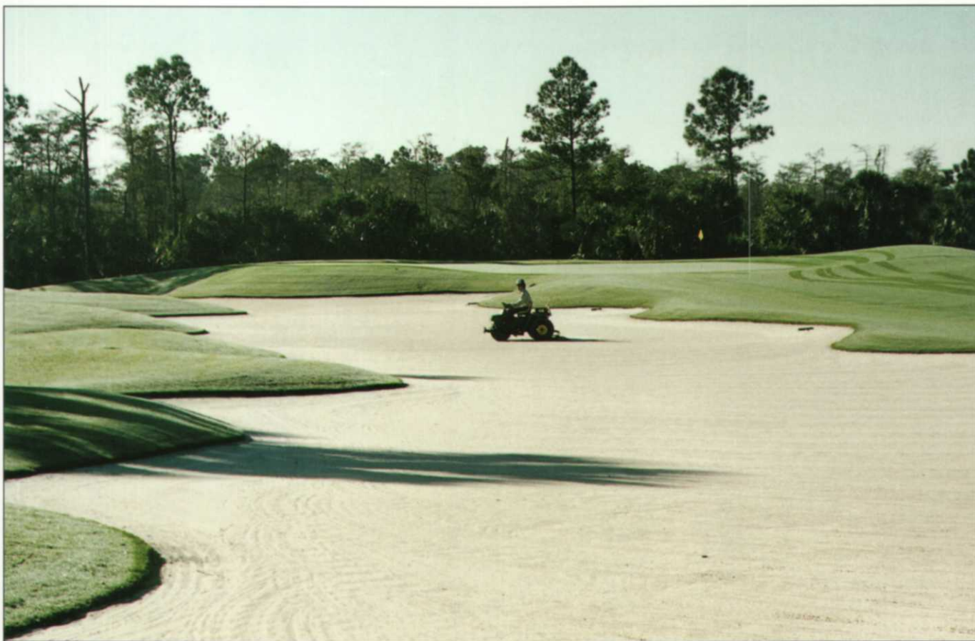
Mechanical sand rakes are a labor saving necessity in large bunkers like this.