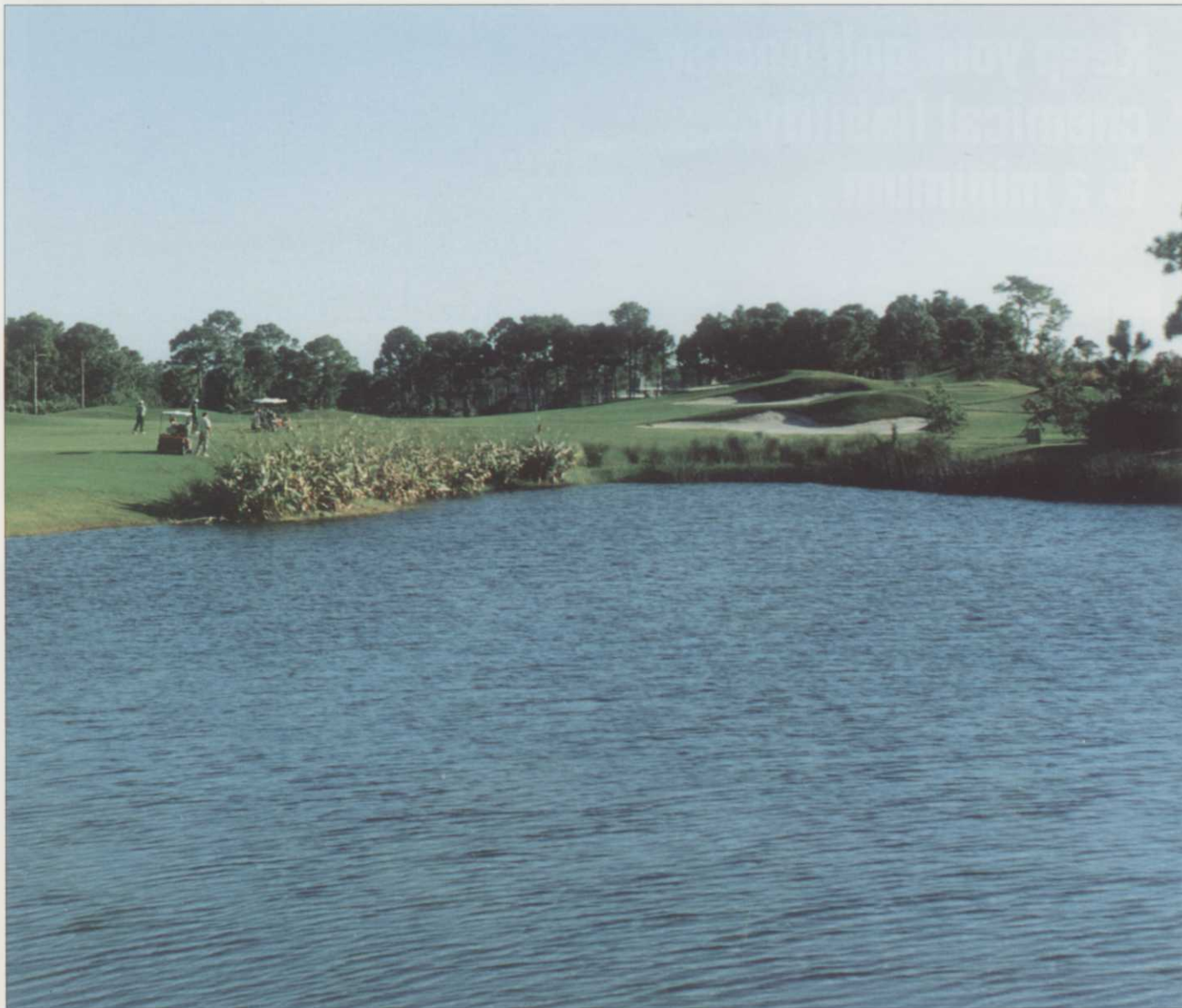
Aquatic plant communities not only provide beauty to the golfers, but also provide food sources for wildlife as well as cover and nesting sites for the many species of birds that inhabit the course.

maintaining native vegetation and add only currently existing varieties on the golf course if additional material is needed.