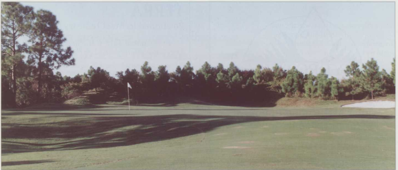
Pines will provide a natural but dramatic backdrop for this green when they mature.