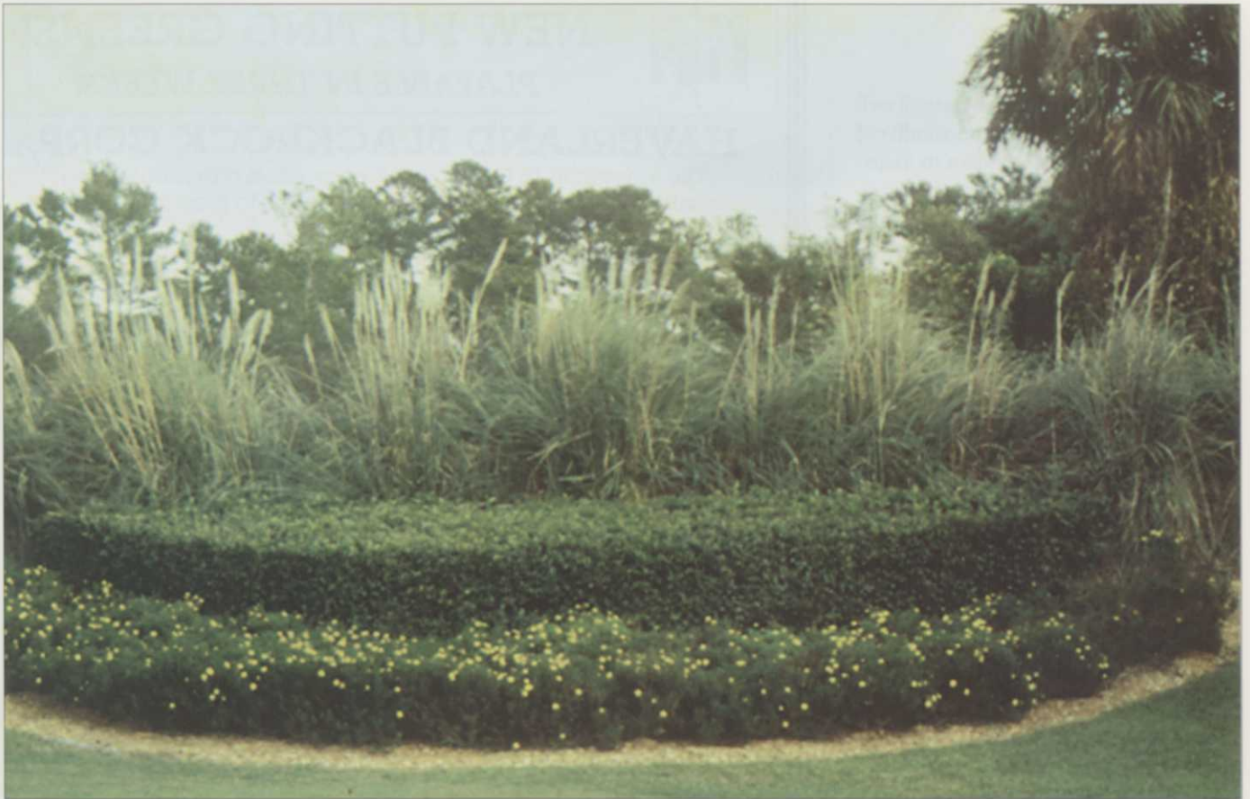
From manicured grounds to natural vegetation in a three-tiered planting that not only ties in the taller trees in the background, but also quite possibly hides something unsightly — or at least “unnatural” — such as a pump station.

We try to never create any new shade problems by avoiding planting large trees to the east or south of a green or tee or even a fairway.