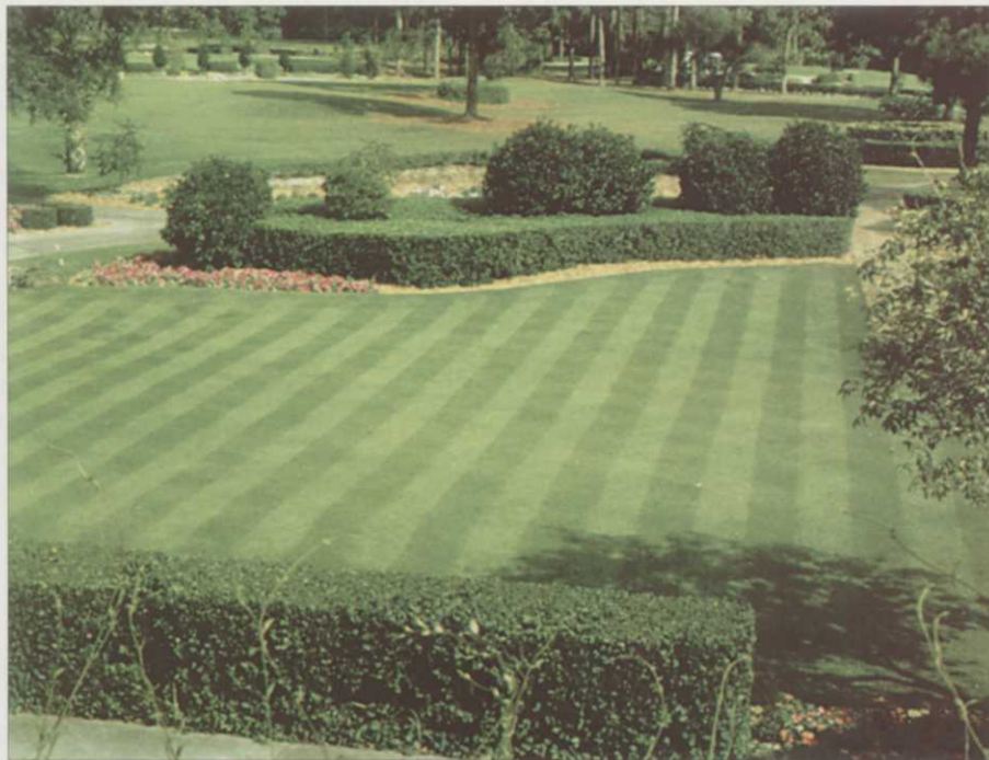
A touch of formality can blend nicely with more natural plantings with thoughtful, careful planning.

The polymers were placed in the root zone by injecting them through a modified spray rig. A powdered form of polymer was necessary to allow it to pass through the sprayer and the injection