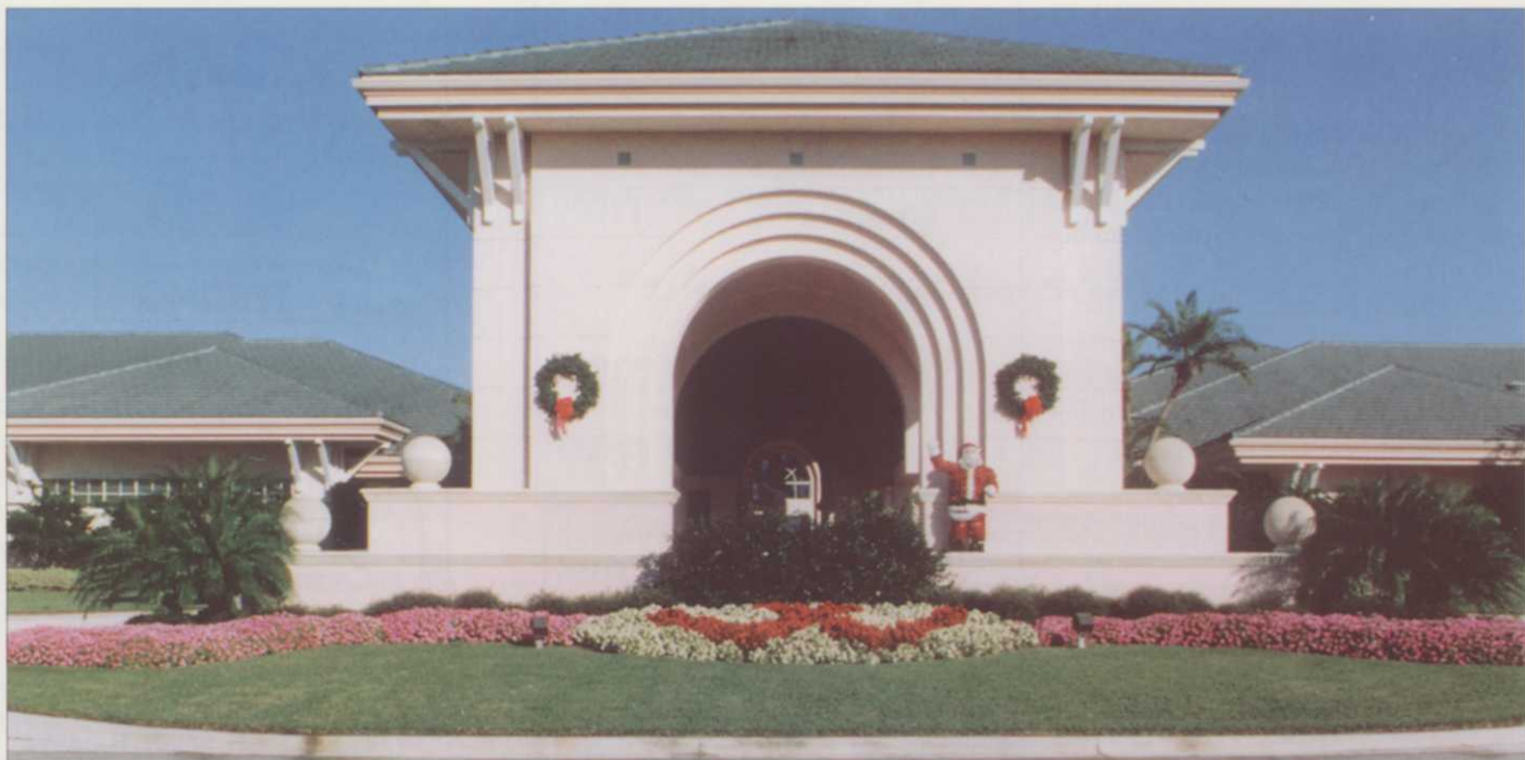
Bright colors — whether from annuals, perennials or flowering trees and shrubs — provide a cheery environment that gets everyone in the mood to slow down and take time to smell the roses.