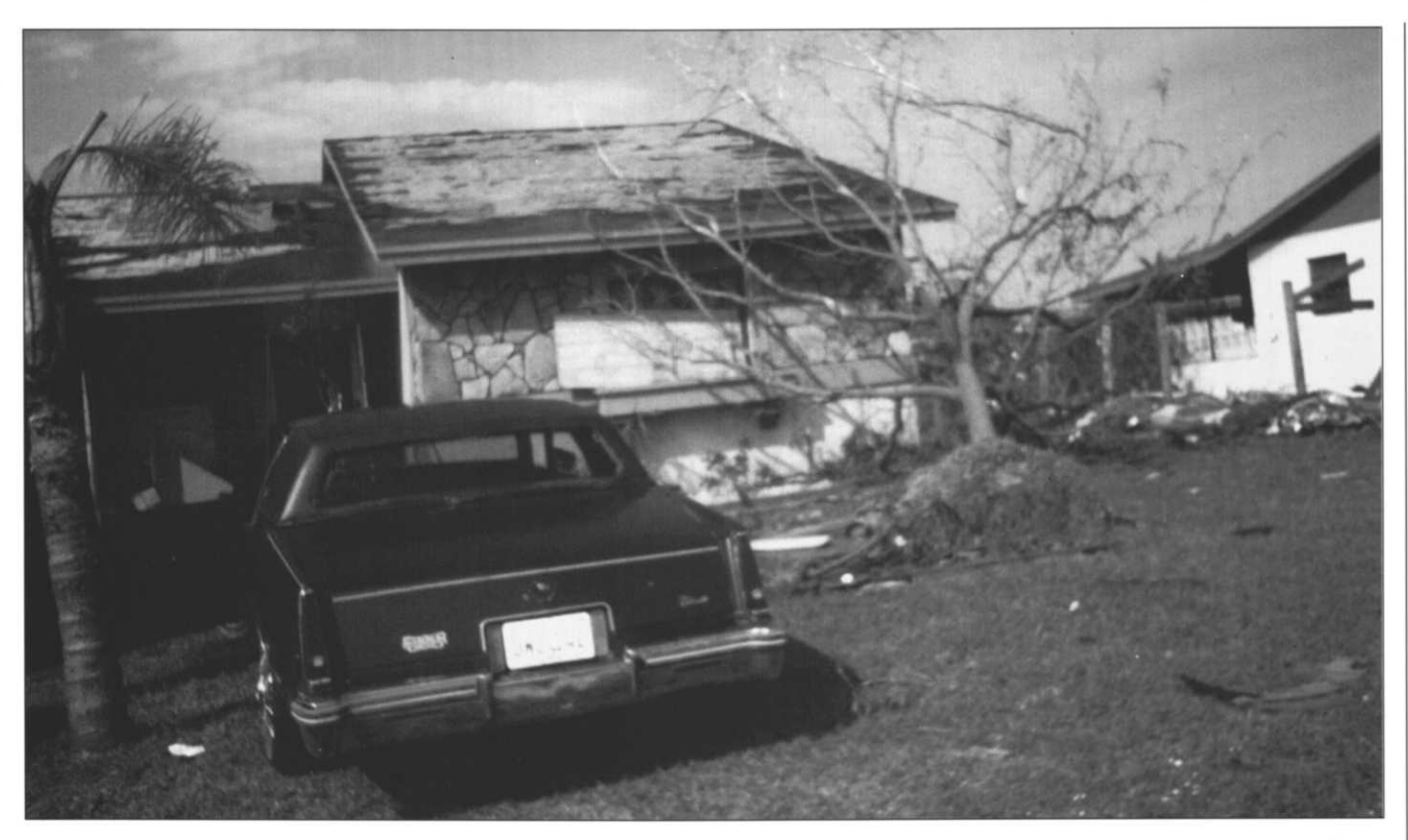
"For two days we just wandered about the house trying to save what we could. The ceiling in the living room was still there so we moved what we could into that area. The next day, it too fell in. So we pulled all we could out and moved it to the kitchen, the only room with a ceiling left." — Ed Ramey