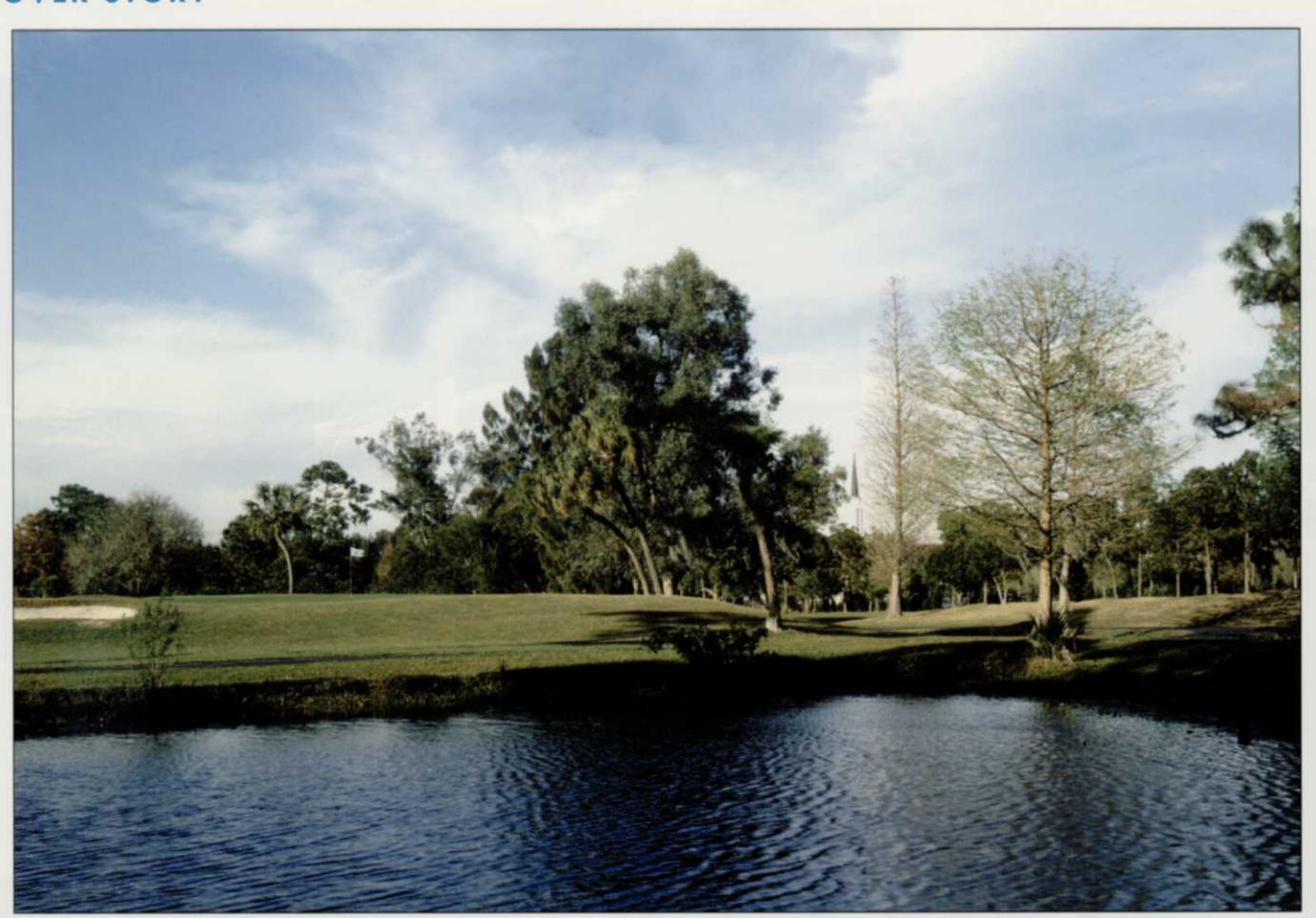
Number 5 Green