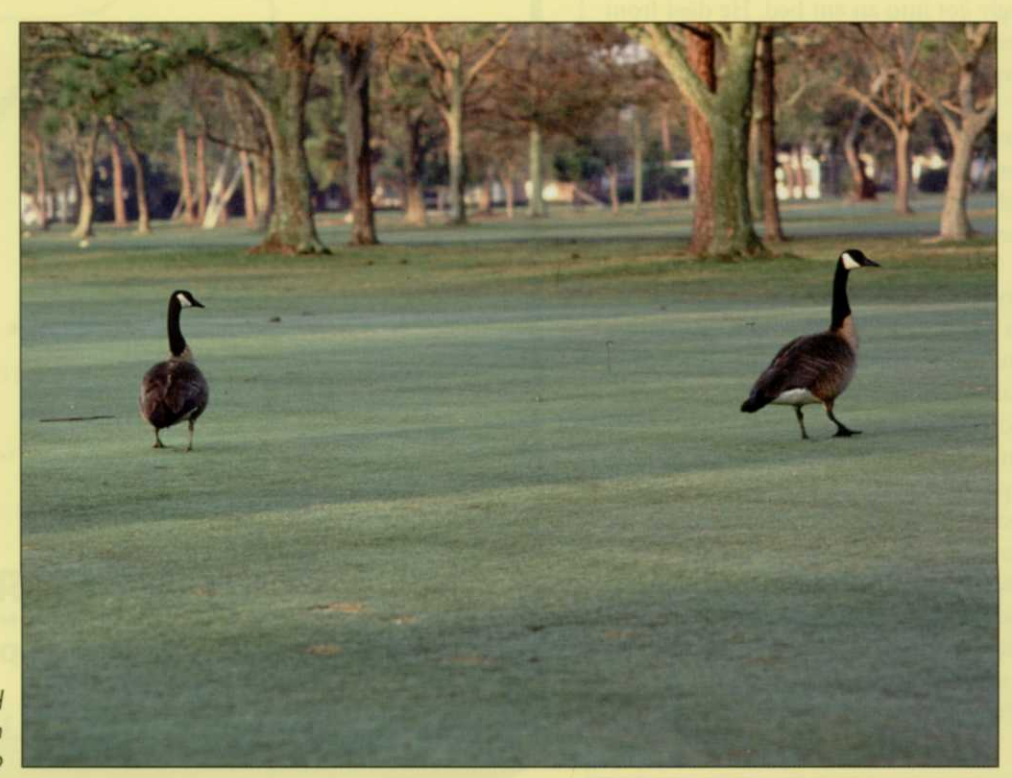
Canada Geese spend winter at Bradenton Country Club