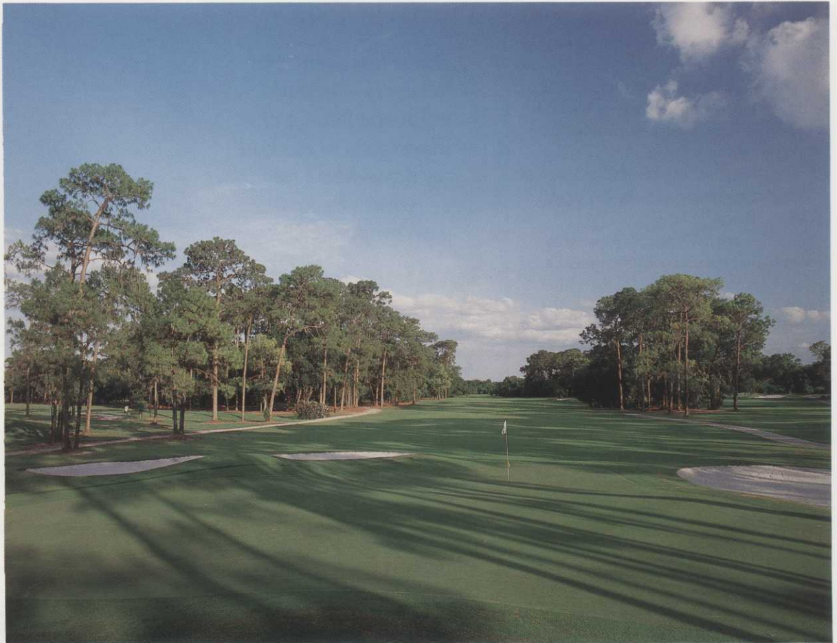
Lake Region Number 11

where he was superintendent of the West course.