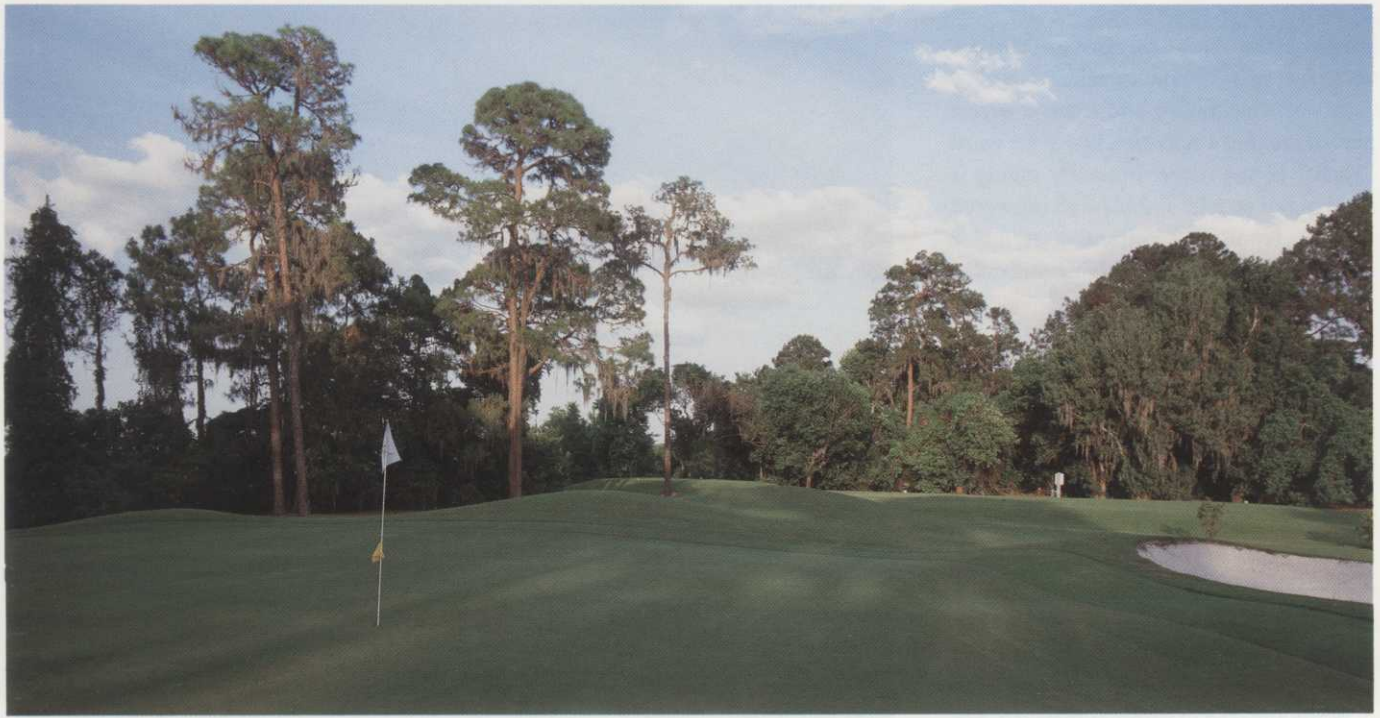
Number 16 shows tall pines.