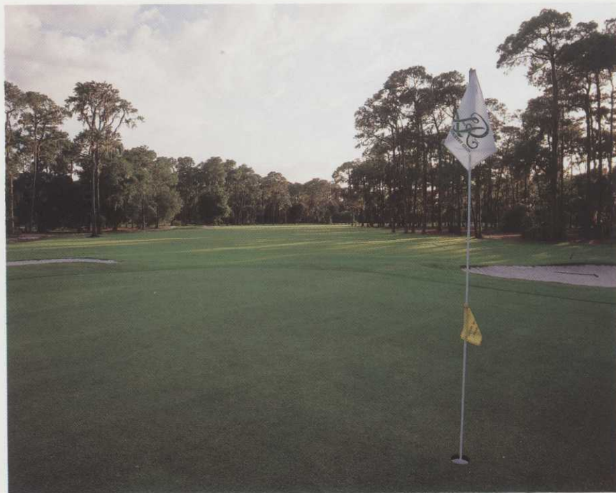
The 16th hole, alternate perspective.

Toro has another very extensive and sophisticated system but the one being tested at Lake Region is a simpler version that requires a PC computer. It will operate Lake Region's older electrical irrigation system (rather than the newer type of hydro-