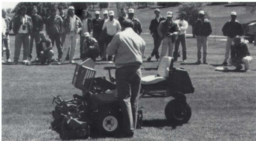
Turf students from all over the country at Jacobsen's annual seminar

"Member-Only Day" has been reduced to the first four and a half hours of the show on Friday, from 8:30 a.m. to 1 p.m.