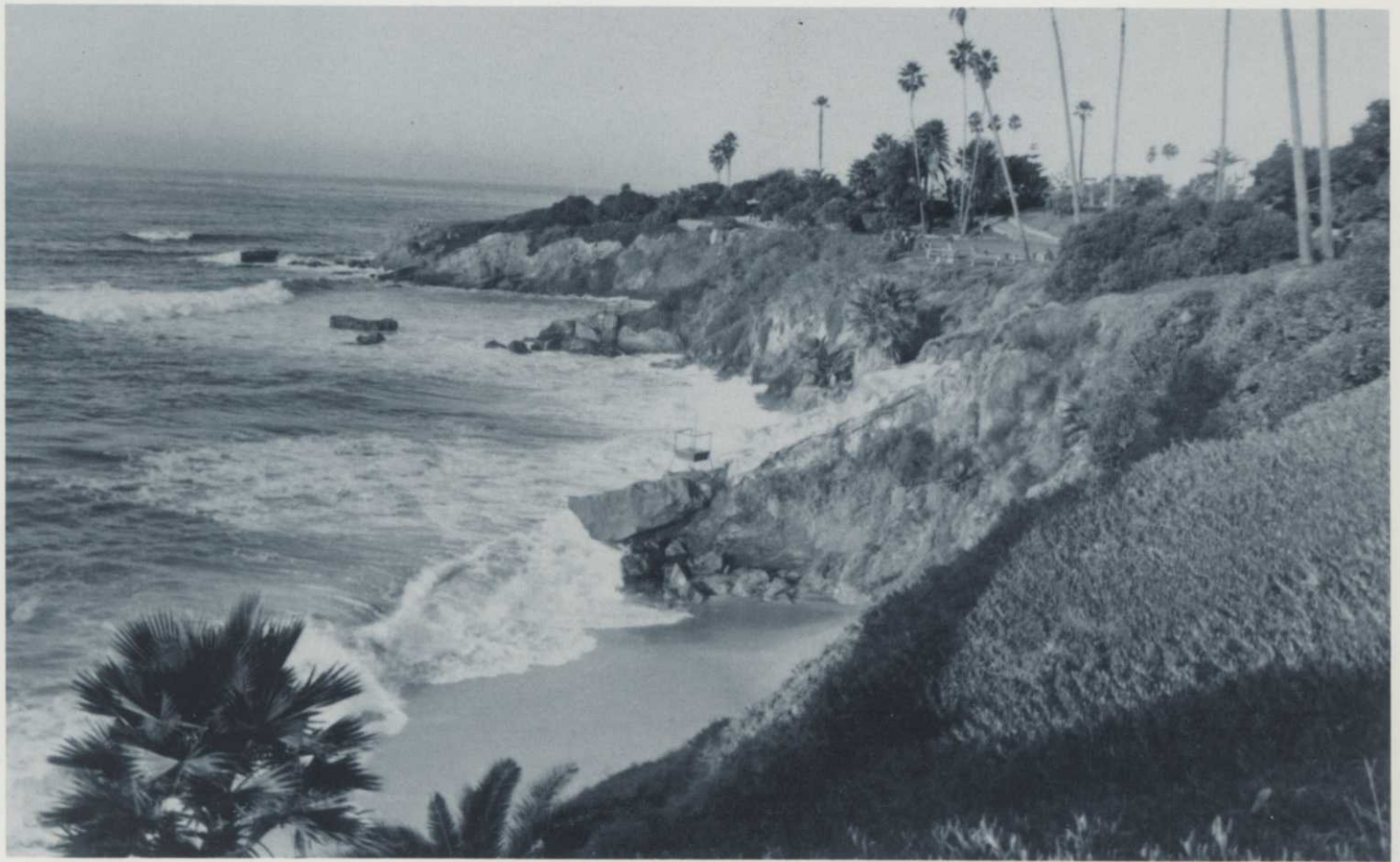
A drive along the California coastline is an experience you will always remember.

The castle, elaborately decorated, could be right out of 11th century Spain.