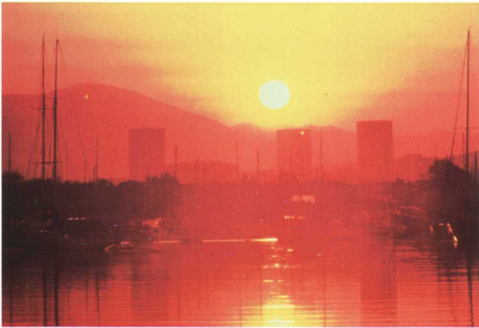
Laguna Beach, an artist's dream town.

Local restaurant critics claim that the SCP is unequalled for the number of noted/award winning restaurants. Across from South Coast Plaza is South Coast Plaza Village , a European-style village filled with boutiques and restaurants.