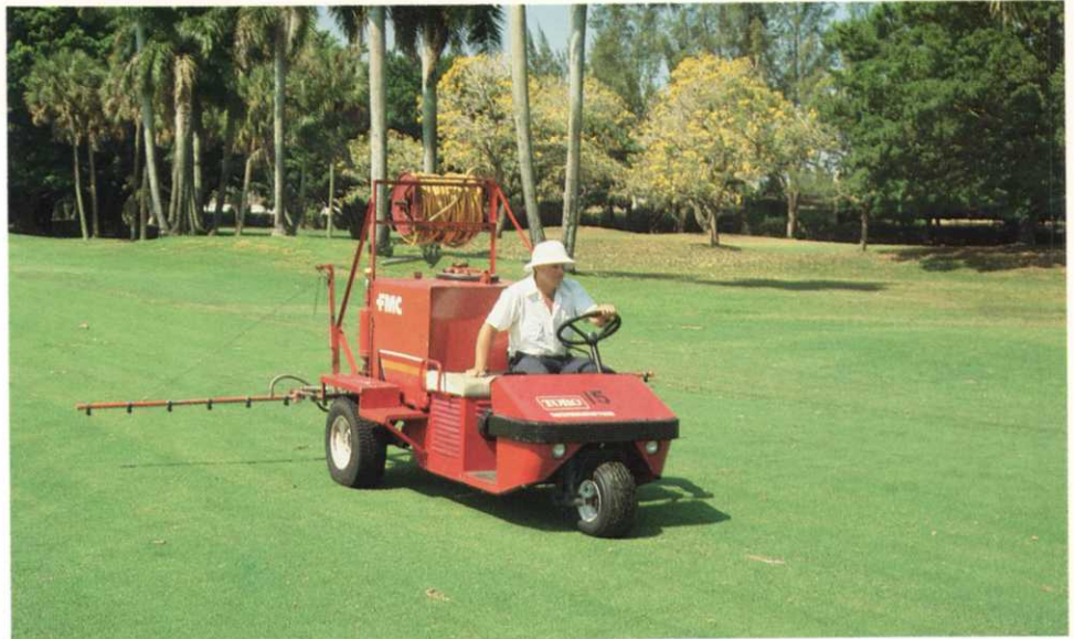
Unsafe pesticide use is unethical but this is not specifically stated in our Code of Ethics.

After looking into our codes of ethics I came to several conclusions; ethical behavior is largely a matter of opinion, many statements in our codes of ethics are too vague to facilitate enforcement and should be changed, ethics violations must be reported by all members and the possibility of enforcement must be a reality, and ethical behavior is a matter of personal morals and choice. ■