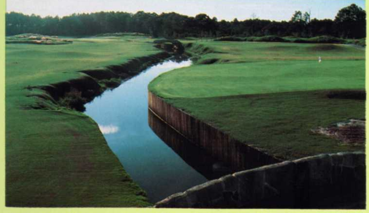
As for the golf course, Jack Nicklaus designed The New Course at Grand Cypress. The design was purposely planned to pay tribute to the great courses of Scotland. There are some similarities to The Old Course at St. Andrews like double greens, stone bridges, walls and burns.