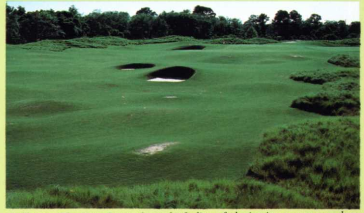
Golfers on The New Course have the feeling of playing in an open meadow. Very little water comes into play and few trees are located within the interior of the course.

Starting time for the shotgun tournament was 9:00 A.M. While the participants waited in their carts for the start, a hubbub of friendly chatter filled the morning air. Then, they were off anticipating a good round of golf.