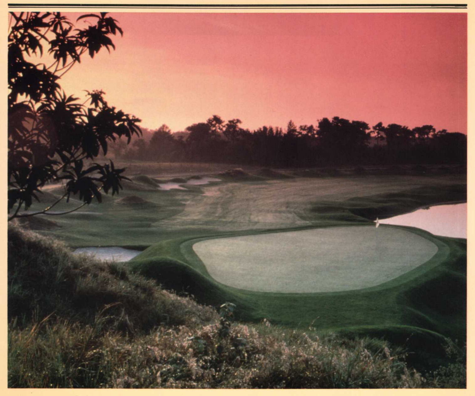
As the sun sets on the beautiful Grand Cypress Golf Course, we start anticipating the 1989 Crowfoot Open.

voted into the Golf Digest Top 100 Golf Courses in the United States.