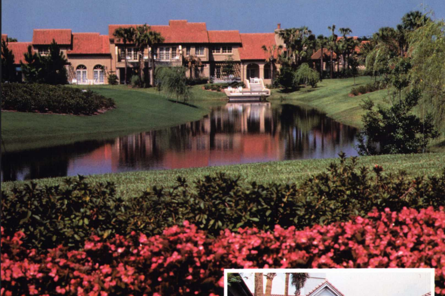
Villas of Grand Cypress — situated among the fairways and waterways of the Jack Nicklaus designed golf course.