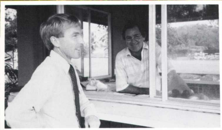
Poa Annua Golf Classic, Naples Beach Hotel & Club.