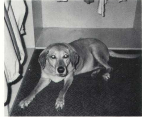
Girl, a stray dog wandered in the pro shop 13 years ago. Found a good home.

F.G.: In your renovation, you seem to have a strong feeling toward keeping the tradition of its era alive.