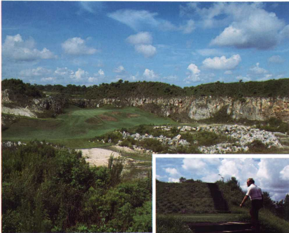
Good luck at the chasm between tee and green on No. 13.