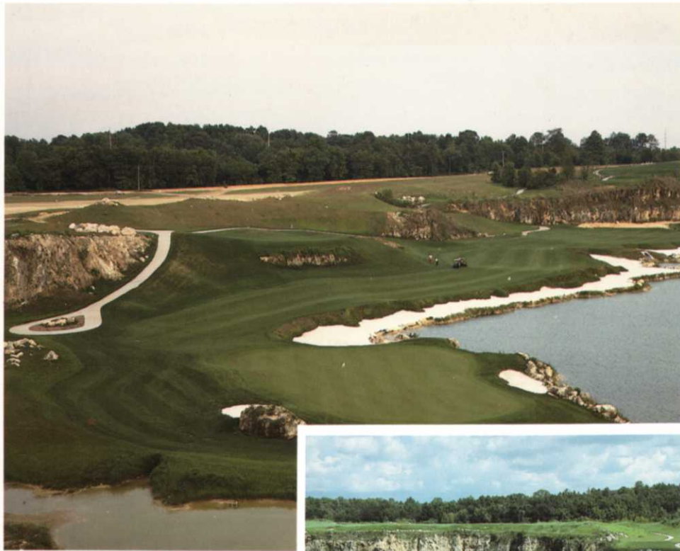
Hole No. 15, 371 yard, par 4, looking from behind the green down the fairway toward the tee. Inset, No. 15 from the pro tee.