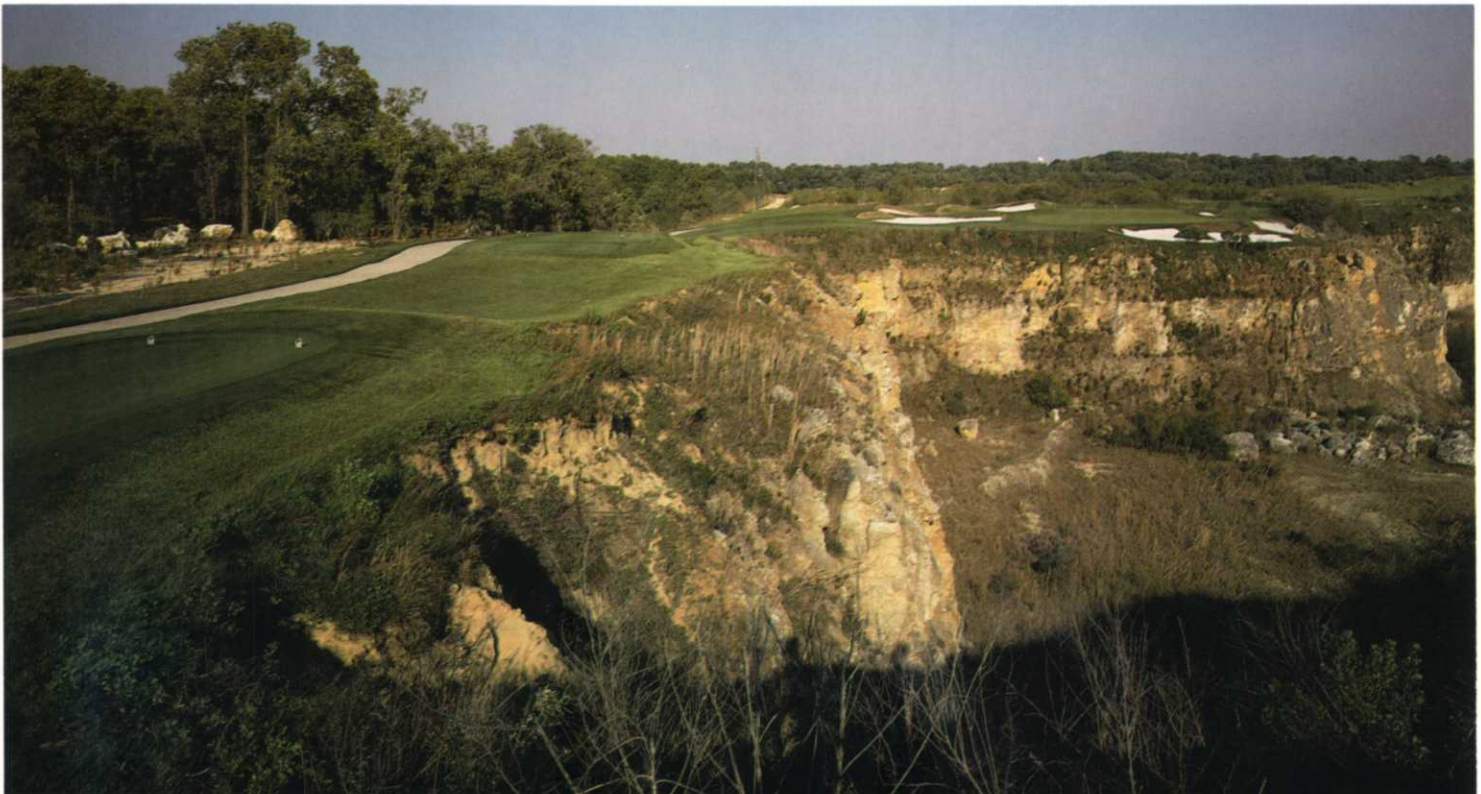
Hole No. 13, 183 yard par 3.

tion rate is limited to an inch every two hours, meaning several holes acquired drainage retention areas just off the fairway.