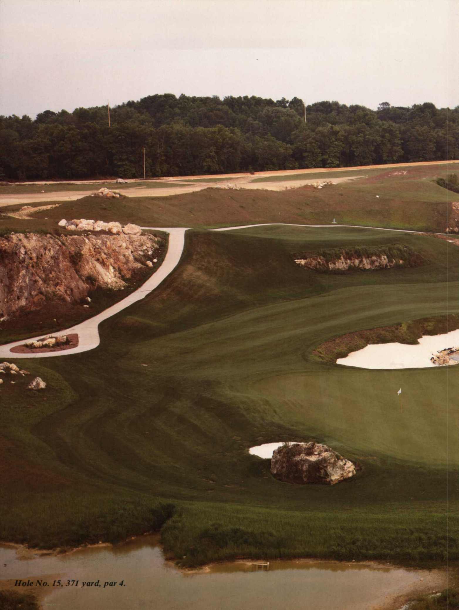
Hole No. 15, 371 yard, par 4.