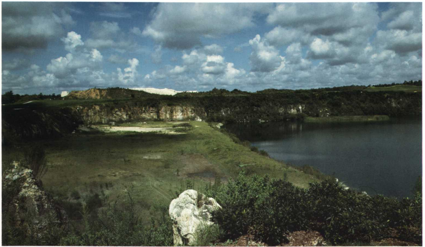
No. 14, 529 yard, par 5 from green back to tees. Pro tee is at extreme right.

greens down in the pits and I thought maybe the limestone and clay would interfere with turf growth but so far nothing has developed.”