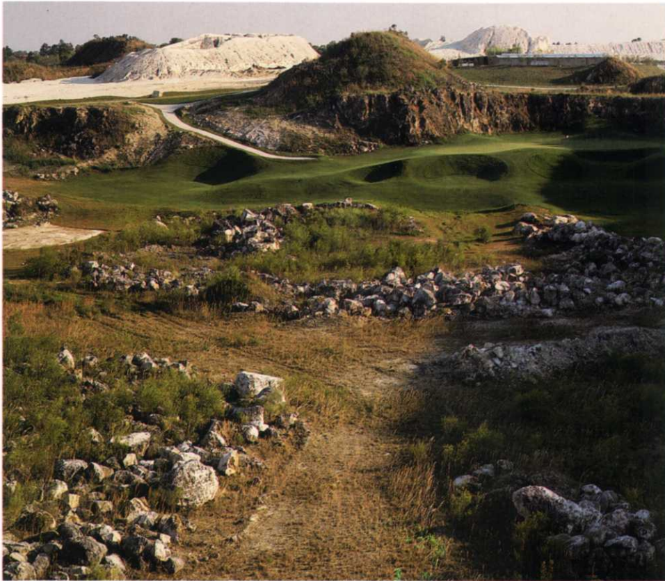
Hole No. 16, 218 yard par 3.