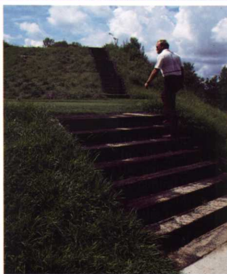
Mounting the stairs to the 177-yard pro tees of No. 13, the first of five Quarry Holes.