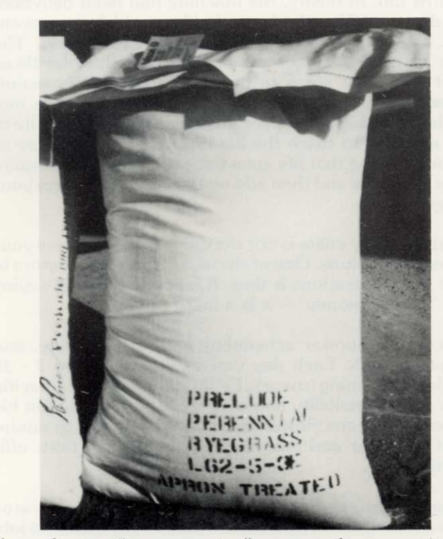
Through a new "gene mapping" process, the true contents of illegitimate bags of seed like this will be positively identified and traced.