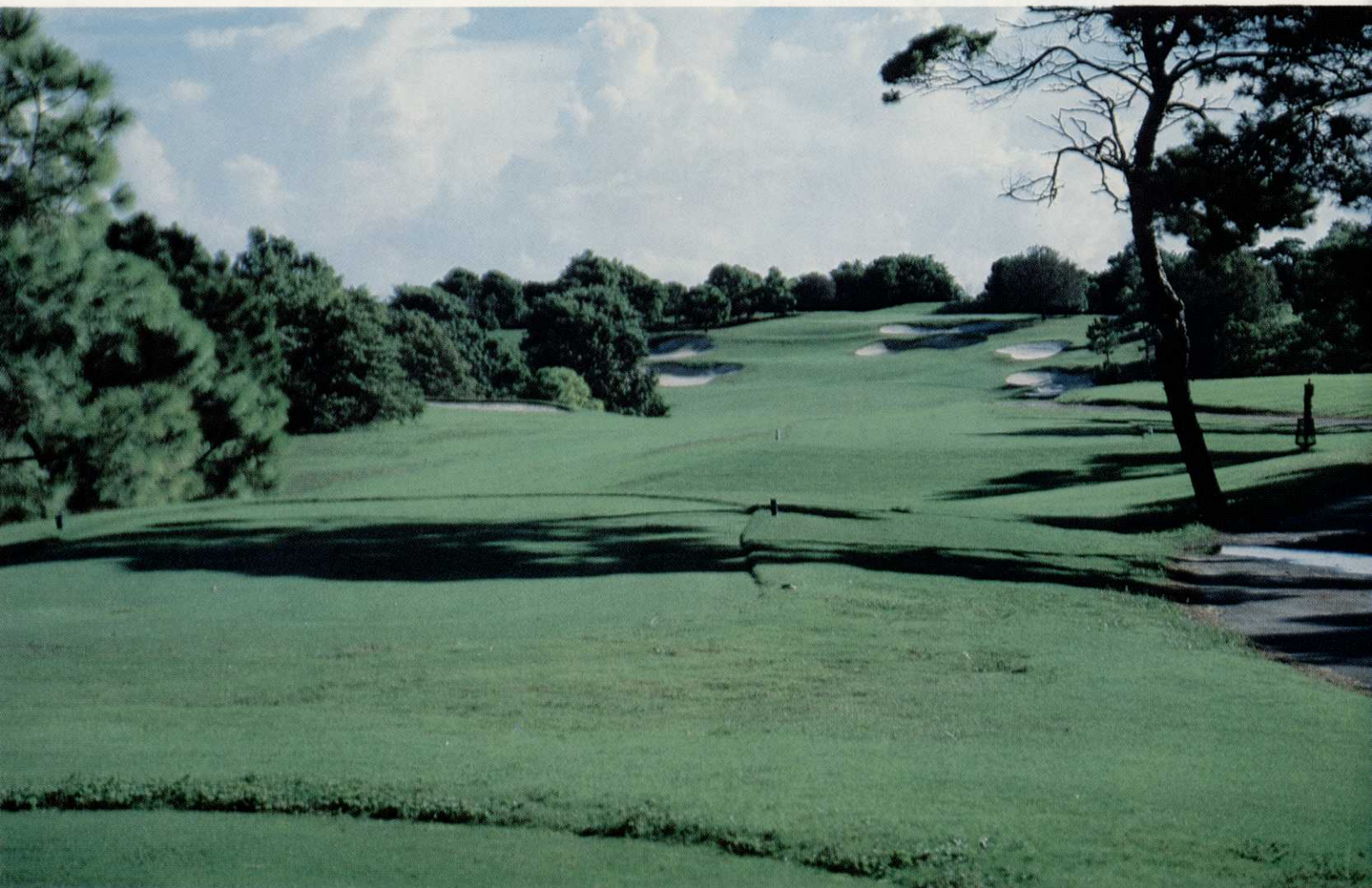
Hole No. 18, Par 4, 423 yards. Second shot to very elevated green.