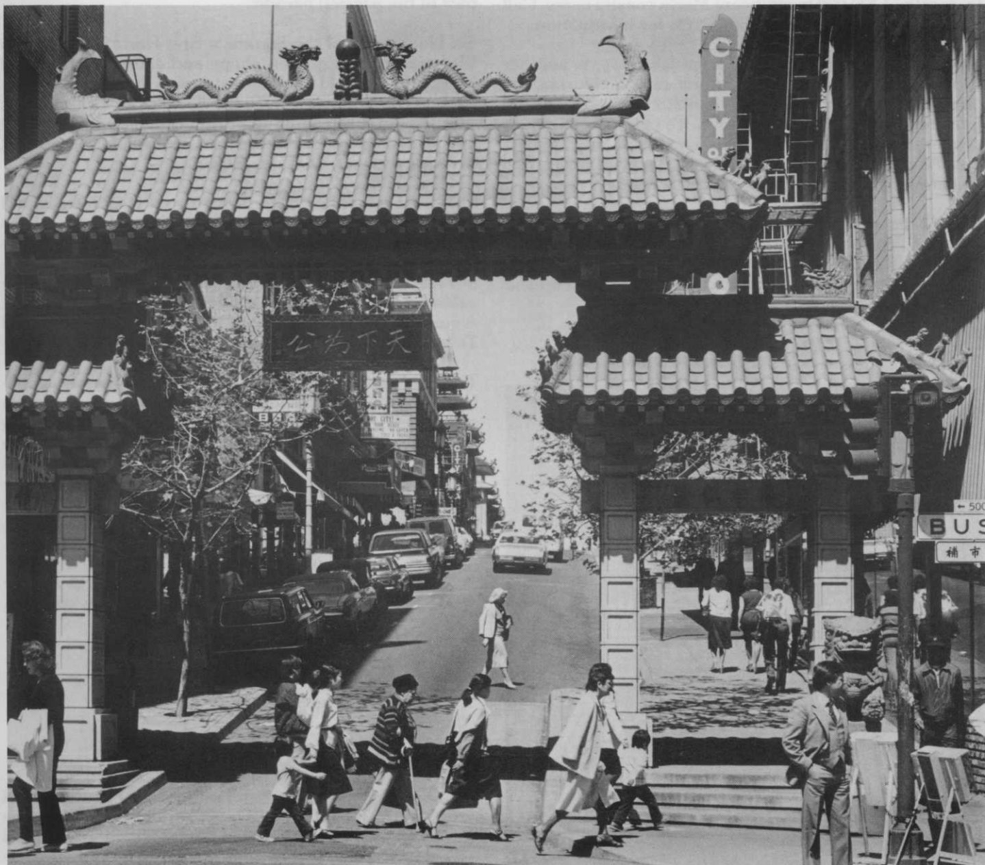
San Francisco's Chinatown has a photogenic front door. The gateway to the West's biggest Chinese settlement is guarded by temple dogs and roofed with green, glazed tiles surmounted by ocher dragons. Ornamental materials for the $75,000 structure, which frames Grant Avenue at Bush Street, were made by Taiwan artisans and presented to the city by the Republic of China.