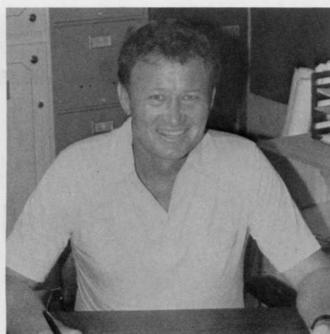
A good superintendent is serious. . . prepared . . .