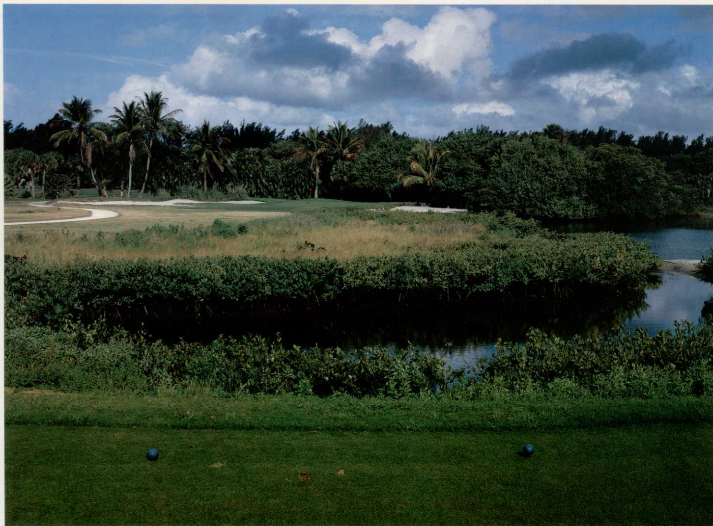
Beauty of Par 3, 12th hole, shows environment of golf course.