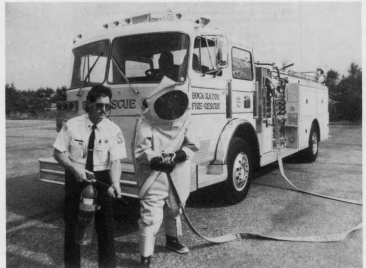
The professionals, fireman suited in hazardous chemical outfit to combat most any situation.