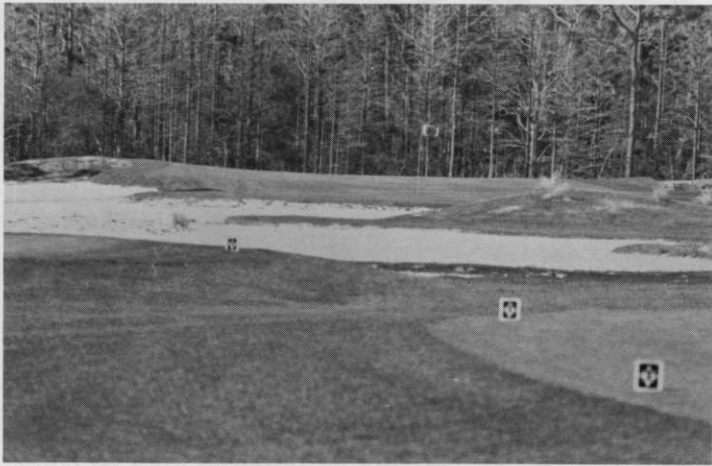
Par 3 185 trap surrounds green.

when water usage is cut back or put on a limited basis. The reasons given were that they could run one head at a time on a green or tee where with most automatic systems, two or three heads come on at a time.