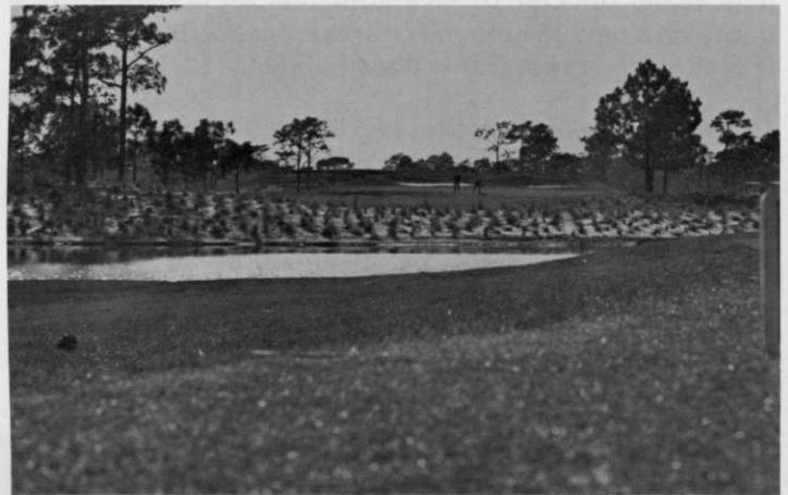
Par 5 dog leg left gulf in background.

The demand for better playing conditions presents problems unique to courses implementing manual irrigation. Since most manual systems have single row head placement the coverage is very limited. Good timing and proper scheduling are a must for fertilizing, aerifications, weed control, etc., in order to get the desired results. Some clubs try to time maintenance practices with periods of regular rainfall to insure success of the programs