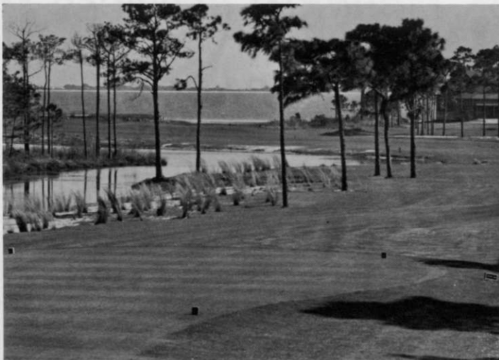
Par 3 190.

Availability of parts and accessories is becoming scarce as most older manual systems become obsolete. With the